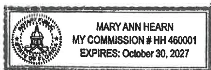
Notary Public Stamp

Personally known or produced _____ as identification.