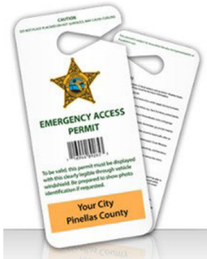
Sample Publication not for Official Use.

Anyone without the emergency access pass will be denied entry.