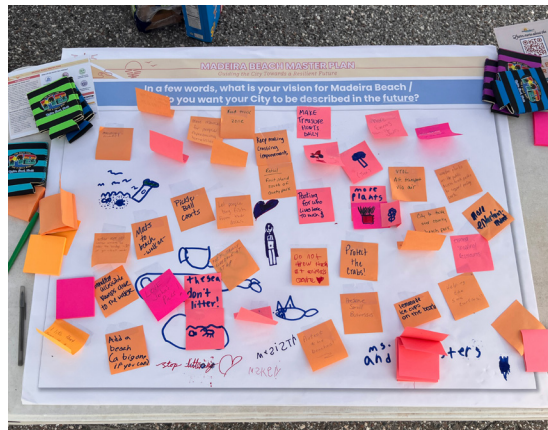
As attendees of Final Friday at John’s Pass passed by the project booth, they wrote down their vision and ideas for improving the City