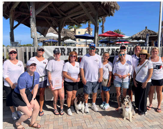
The Project Team spent a Saturday morning with the Trash Pirates of Mad Beach at the August Beach Clean Up to hear from volunteers and see the community in action