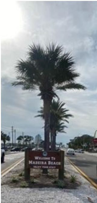
New welcome sign