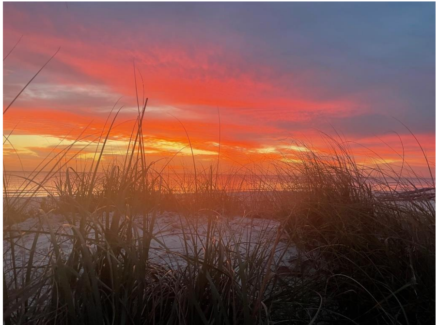
Eclectic Gulf Sky shortly after sunset

I hope many of you enjoyed our various meetings, activities, and events throughout January including the annual Seafood Festival at John's Pass Village, Final Friday at the John's Pass bell tower area, a beach clean-up, and our Commission meetings. Please continue reading to learn of February meetings, activities, and events, all listed on the City's website: www.madeirabeachfl.gov .