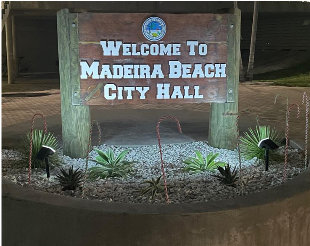
New City Hall sign on new landscaped area