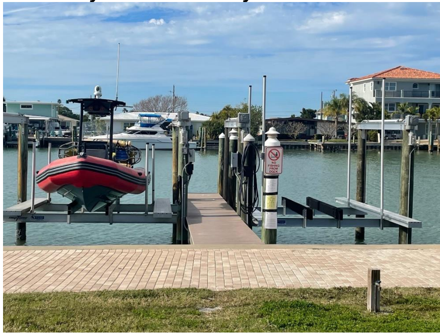
Adjacent to the City's Fire Rescue Boat