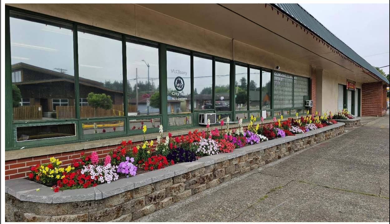
The Planters that we created look very festive with all the bright flowers and give City Hall a nice facelift.

Citywide the Public Works Department has been preparing for Bear Fest.