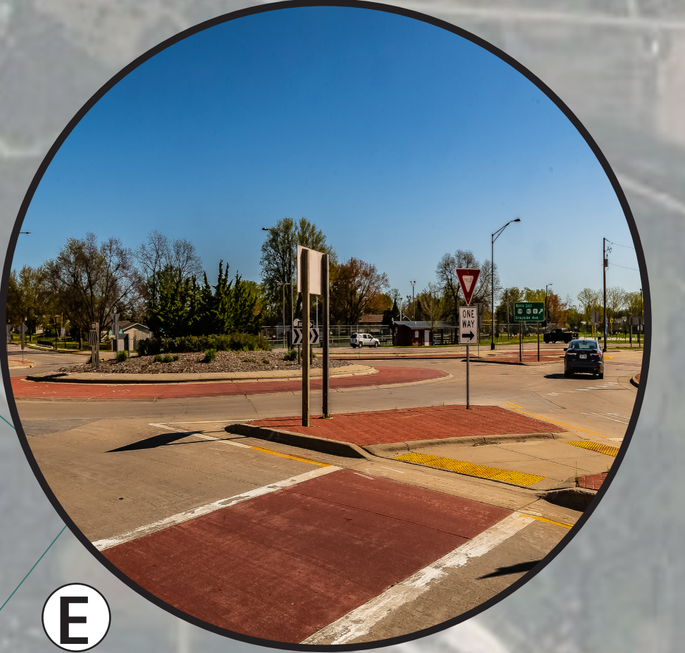
Existing Pedestrian Crossing at Union and Water Street