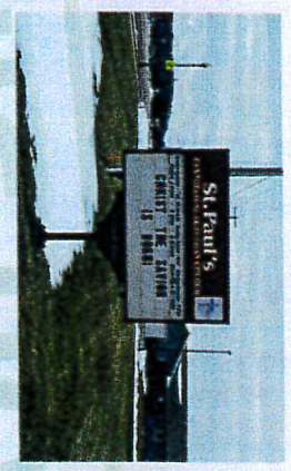
EXISTING SIGN TO BE REPLACED

CLIENT HAS DESIGNATED THE LOCATION IN WHICH THE SIGNAGE IS TO BE INSTALLED. THE CLIENT HAS THE SOLE RESPONSIBILITY FOR THE STRUCTURAL INTEGRITY OF ALL EXISTING STRUCTURES TO SUPPORT THE SIGNAGE. PLEASE REVIEW STOPS & PROOF CAREFULLY - CHECK FOR TYPOGRAPHICAL ERRORS & DIMENSIONS. LIGHT ACCURACY, ETC. CUSTOMER HAS SOLE RESPONSIBILITY TO CORRECT ANY ERRORS. DISCLAIMER: THE COLORS SHOWN IN THIS DRAWING PROVIDE CONCEPTUAL COLORS & GRAPHICS LOCATIONS ONLY. THE COLORS MAY NOT MATCH THE ACTUAL MATERIALS. PRINTING OR VITAL COLORS THAT WILL BE COPIED IN THE SIGN'S SHOW. ALL SIZE, SHAPES, COLORS, ETC. ARE CONCEPTUAL & MAY VARY FROM ACTUAL. PRODUCT A NUMBER/CHANGES LABEL WILL BE ADDED TO THIS SIGN AT THE DISCRETION OF GRAPHIC HOUSE, INC.