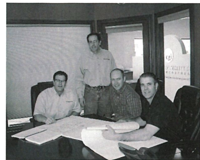
Principals (left to right):