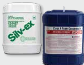
Silvex Plus or Phos Chek foam + $135 00 /pail