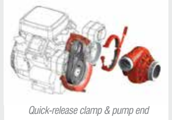
Quick-release clamp & pump end

The Thunderstorm Slide in Unit now comes plumbed ready for our exclusive "hot swap" quick change pump technology allowing users to quickly and easily field replace the Hot Shot 4 pump with minimal tools, because sometimes things happen. Purchase our optional pump end replacement kit and never be without a pump in the field.