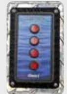
water level indicator + $655 00