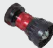
Tip 1.5" 20/60 gpm + $99 00