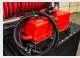
3 gal fuel tank with copoly mounting bracket