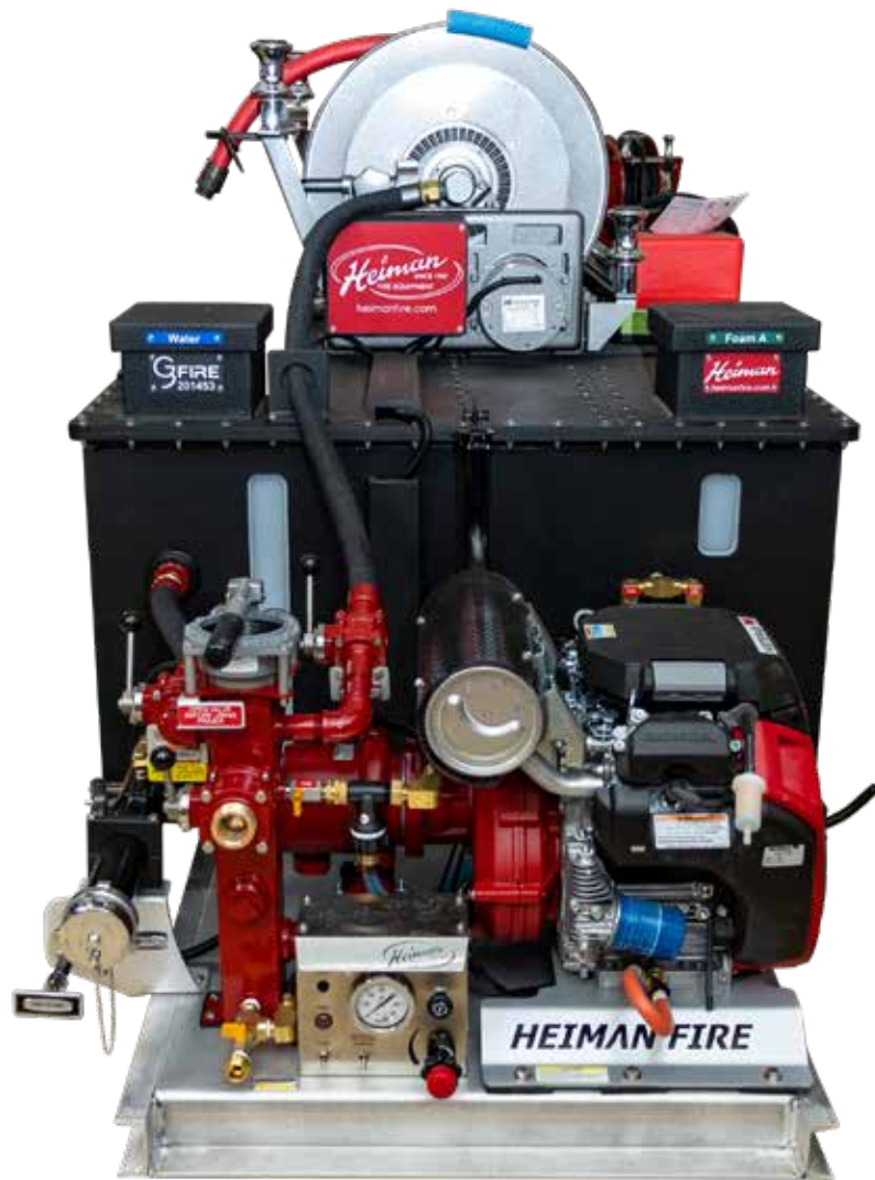
*pictured with some additional options and upgrades *foam cell optional