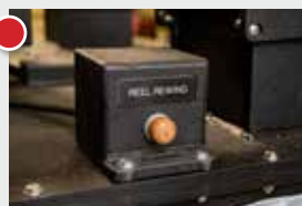
Push button electric rewind system