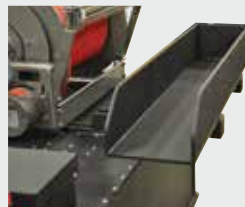
copolymer polypropylene hose tray + $445 00