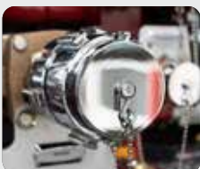
2.5" inlet w/cap and optional valve + $525 00