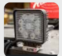
LED work light + $175 00