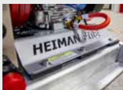
Powder-coated pump base