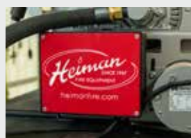
Weather proof electrical box & high pressure flexline plumbing with stainless steel couplings