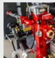
Elkhart valves with ball control handles on a painted stainless steel manifold