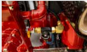
Scotty foam system + $1100 00