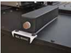
Push button electric rewind system + $585 00