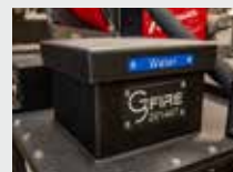
• Removable top with sleek stainless steel bolts • Clearly labeled & color coded foam and water fill towers with strainer