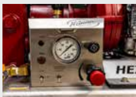
Completely enclosed control panel with on/off start, low pressure protection override, vernier throttle, choke, liquid filled gauge, low oil light, & light shield with LED light

250 gallon: 52" H 400 gallon: 66" H 300 gallon: 56" H 500 gallon: 74" H