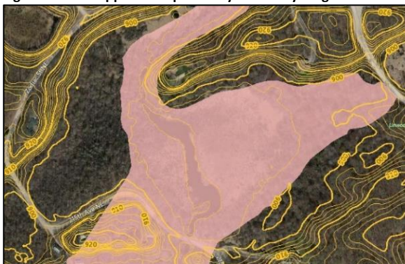
Figure 1: The mapped floodplain may not always align with on-the-ground contour elevations.