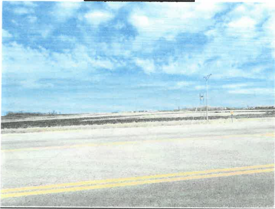
Front View North from T.H. 68