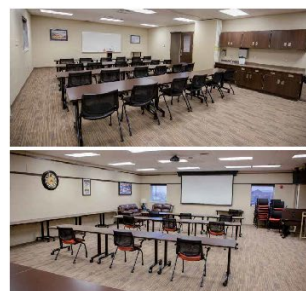
With a variety of spaces, the facility accommodates events and gatherings large and small, including trade shows, expos, weddings, concerts and meetings, etc.

1651 Victory Dr. Marshall, MN 56258 Phone: (507) 537-1865