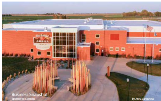
Business Snapshot Sponsored Content

WWW.REDBARONARENA.COM 507-537-1865 @REDBARONARENAEXP0