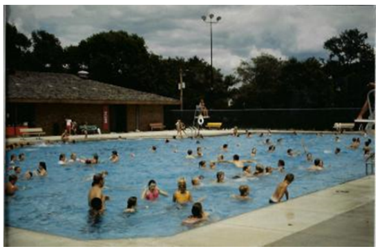
The current 1969 reconstructed facility is showing its age and has numerous deficiencies in code compliance, operations, customer experience and maintenance costs.