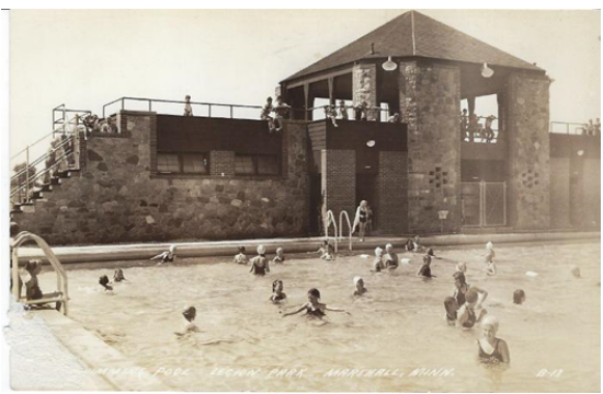
The original 1937-38 constructed Marshall Pool. The Main Pool is still in use today.

The mechanical and electrical systems have deteriorated and are in need of repair. Water line breaks are common and waste lines are failing. There is a significant problem of sewer gas entering the shower area of the building and staff have made a makeshift repair that needs replacement. The staff has had to make many repairs to the plumbing systems and these repairs are exposed and add to the poor appearance of the building. Exhaust fans are old and inadequate and provide poor ventilation within spaces. Electrical systems are original.