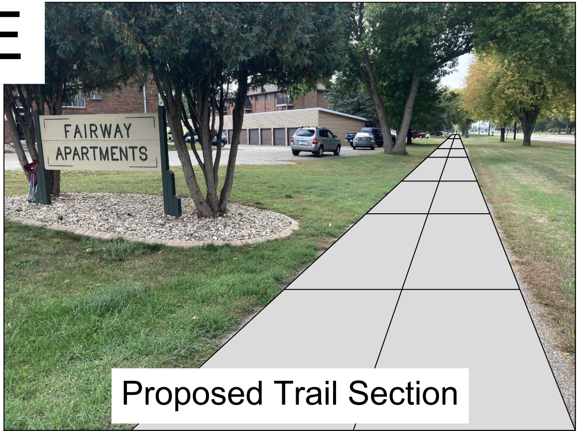
Proposed Trail Section