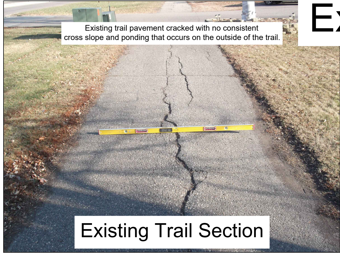
Existing Trail Section