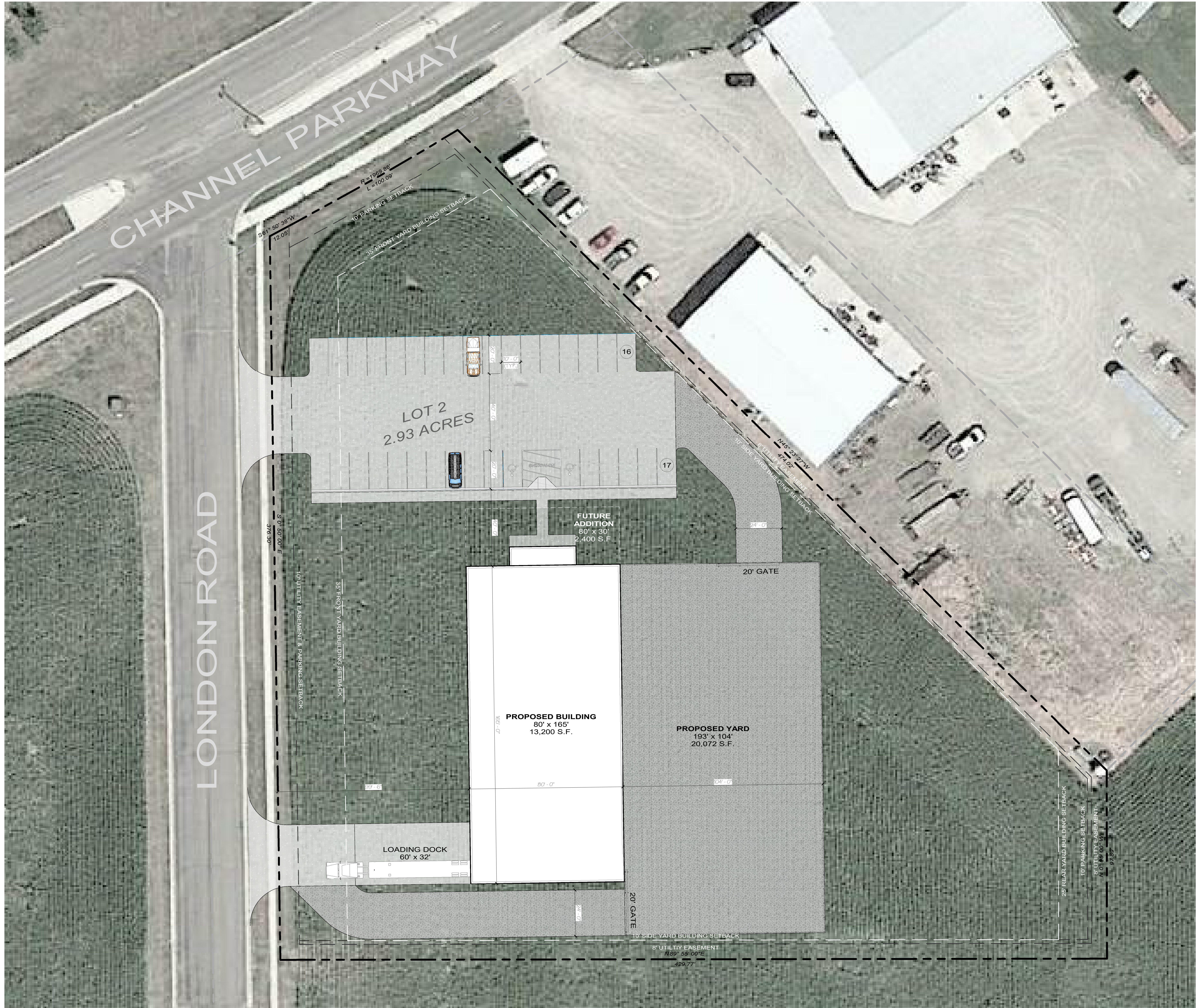
1 SITE PLAN 1" = 20'-0"