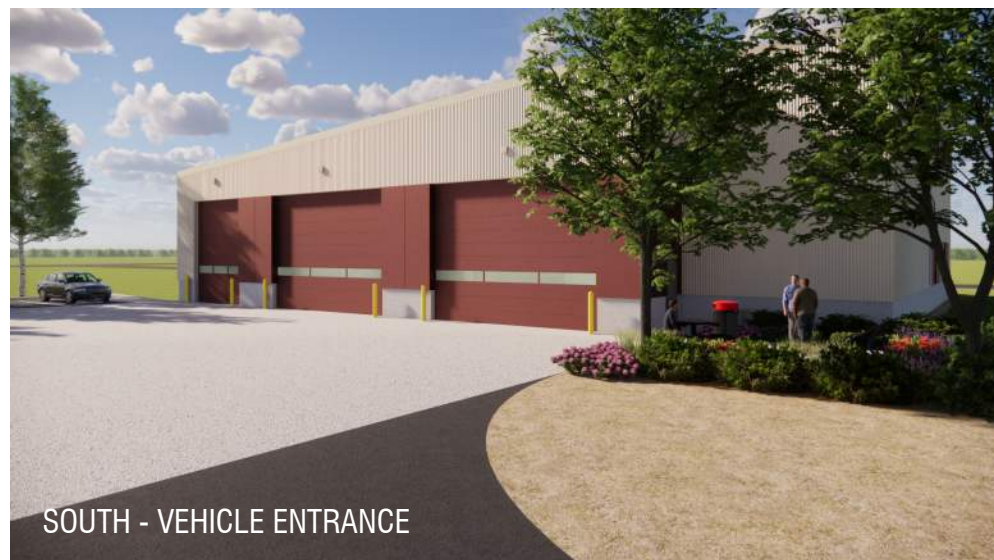
SOUTH - VEHICLE ENTRANCE