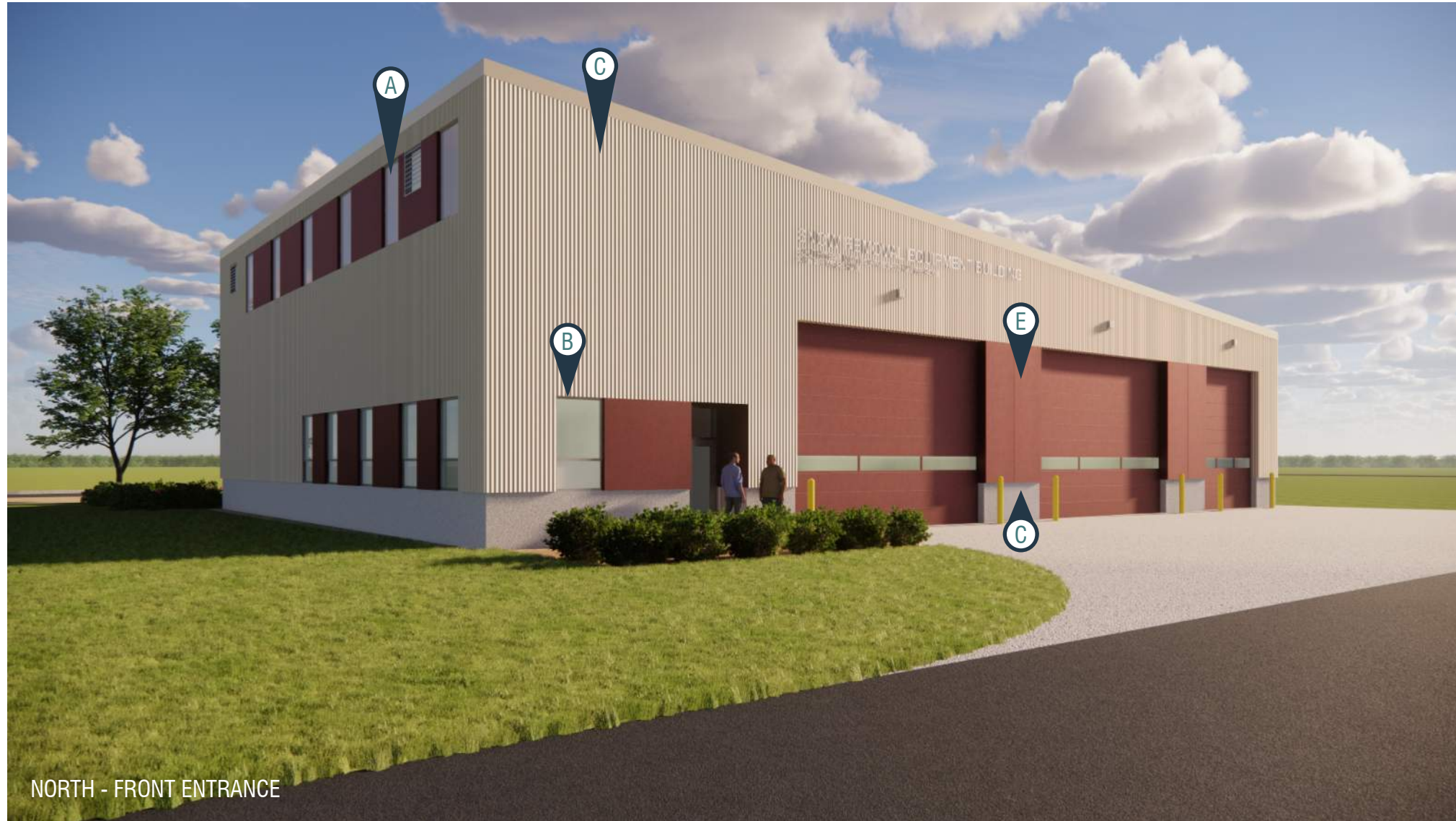
NORTH - FRONT ENTRANCE