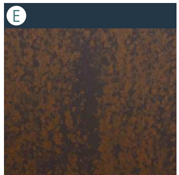
INSULATED METAL WALL PANEL

MP-1 BASIS OF DESIGN: METL SPAN STYLE: CF MESA COLOR: ALMOND