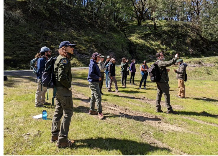
Staff from each partner gather for a site visit at Lake Lagunitas to learn about forest health work being led by Marin Water.

One important benefit that creating and nurturing our partnership has brought is weaving together a community of colleagues dedicated to protecting the mountain and advancing programs and projects together. We often hear about the value that building this network provides to staff at each partner agency, who now have an expanded team of support for their work and for professional development.