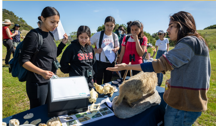
Community science, engagement, and workforce development come together on a day near Azalea Hill where interns helped to host a member event and our Community Science team conducted a springtime bioblitz with students from San Rafael High School's AVID program.