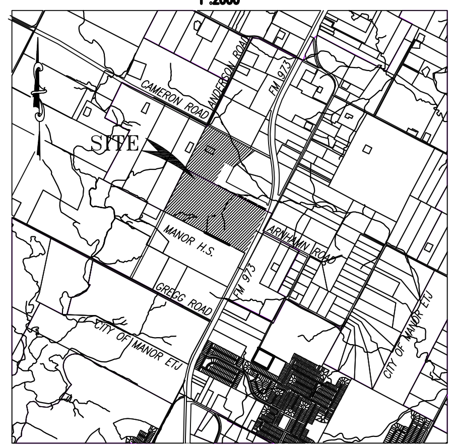
VICINITY MAP 1"=2000'