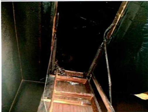
56-Front Room Attic