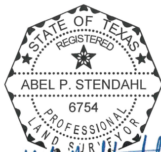
EXHIBIT OF A 3.700 ACRE RIGHT-OF-WAY TO BE RELEASED

ABEL P. STENDAHL REGISTERED PROFESSIONAL LAND SURVEYOR NO. 6754 601 NW LOOP 410, SUITE 350 SAN ANTONIO, TEXAS 78216 PH. 210-541-9166 abel.stendahl@kimley-horn.com