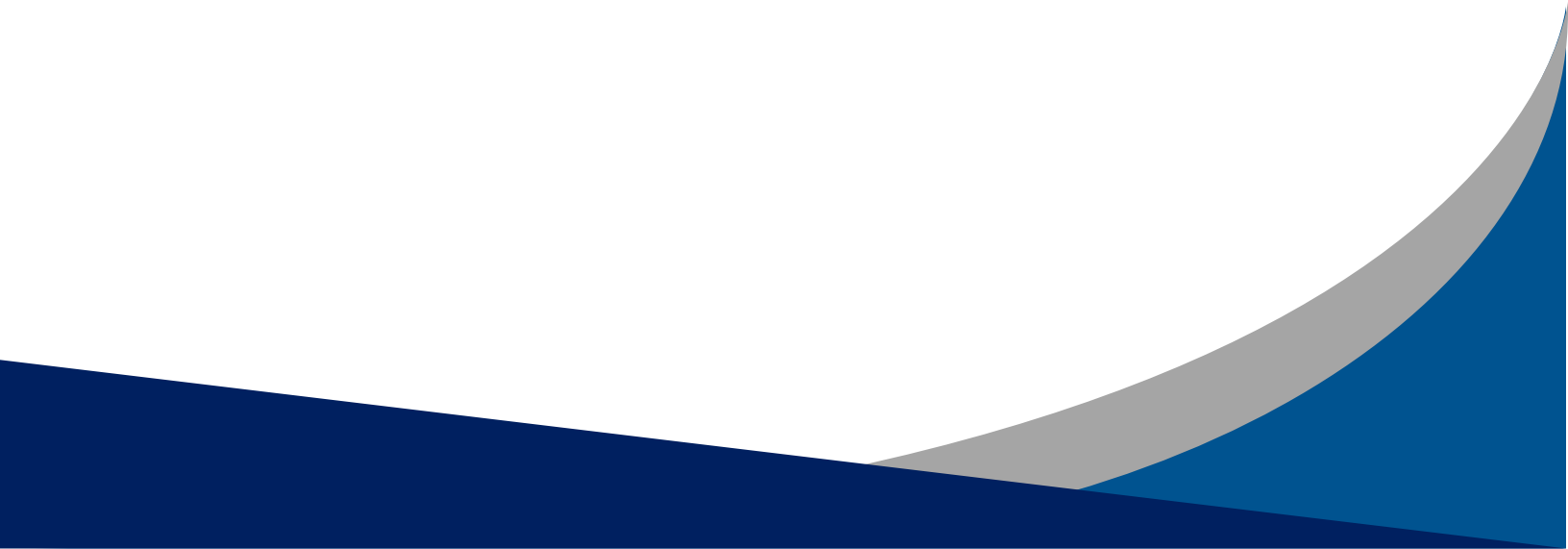
Exhibit A: Contract General Terms and Conditions