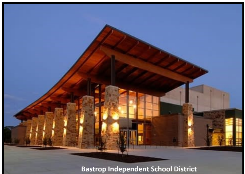
Bastrop Independent School District