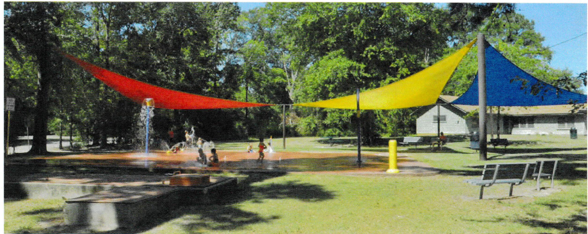
Splash pads provide water-based recreation that can be easily incorporated into a park setting

ShadowGlen Open Space is the City’s largest park and remains largely undeveloped. It is also entirely in the floodplain. Improvements will need to be carefully considered to