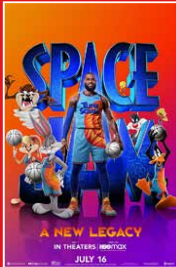
Friday, June 17, 2022 Space Jam II