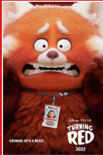
Friday, June 10, 2022 Turning Red