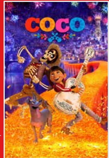
June 24, 2022 Coco