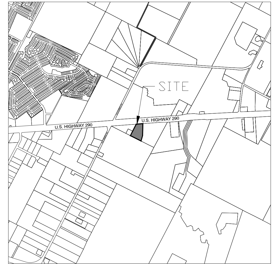
VICINITY MAP SCALE: 1"=2,000'