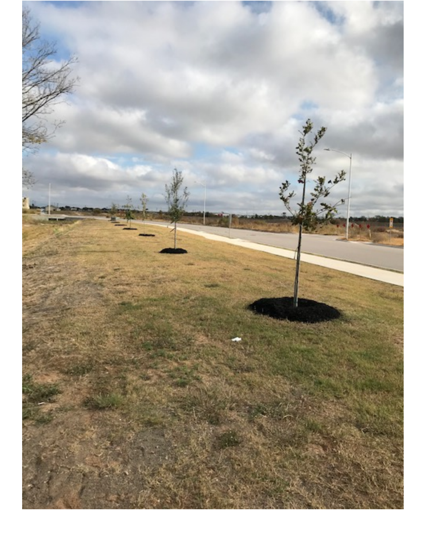
Planted 14 trees in Timmerman Park along Skimmer Run.