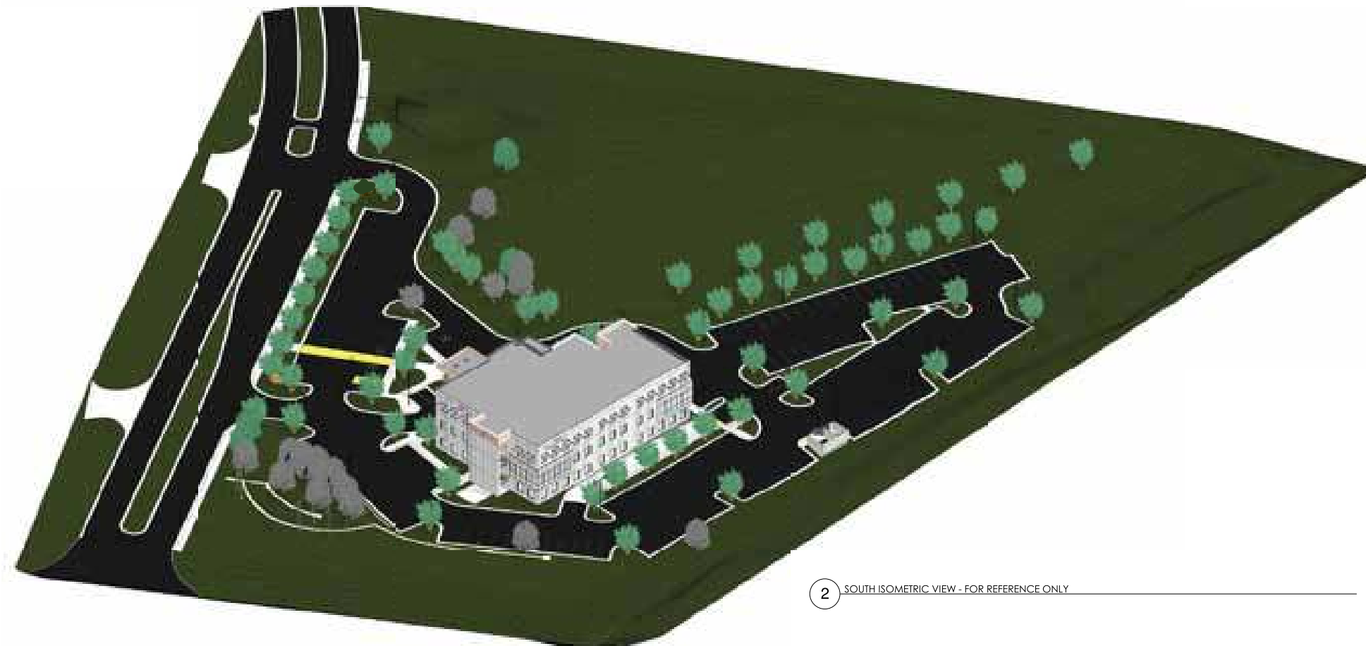
2 SOUTH ISOMETRIC VIEW - FOR REFERENCE ONLY