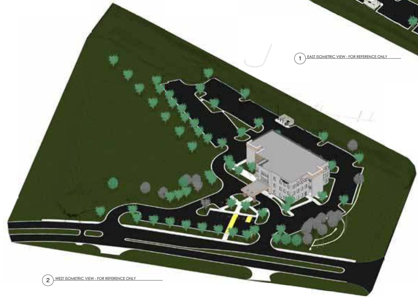
2 WEST ISOMETRIC VIEW - FOR REFERENCE ONLY