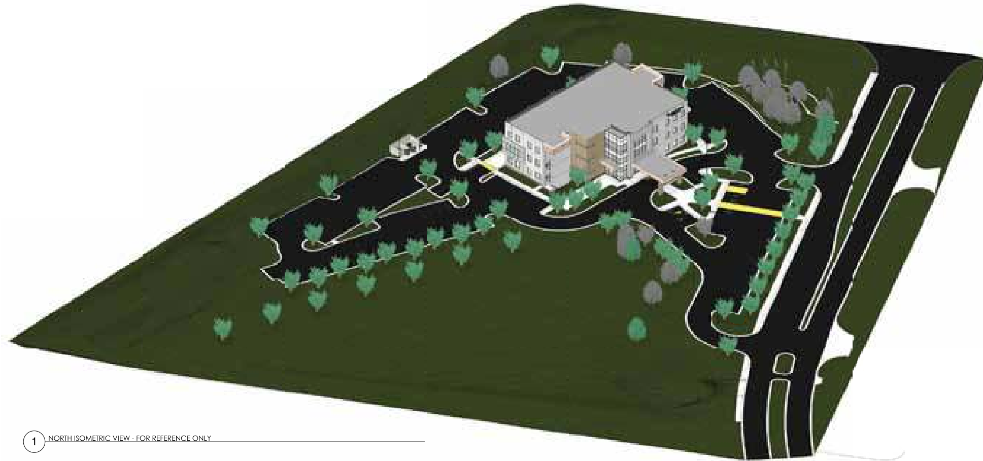
1 NORTH ISOMETRIC VIEW - FOR REFERENCE ONLY