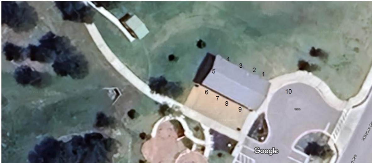
20 ft