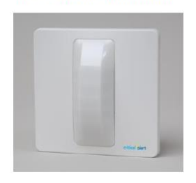
ZDL-5001 Zone Dome Light

This a device located in the ceiling to enunciate General, Emergency, and Code Blue alerts (can be filtered for Emergency and Code Blue only) generated from other units in the facility at the Emergency Dept nurse's station.