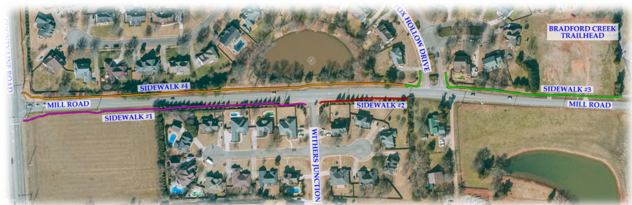
FIGURE 1 – MILL ROAD SIDEWALK OPTIONS