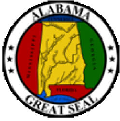
Kay Ivey Governor