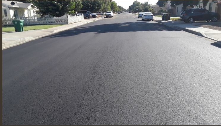
Orange Avenue Improvements