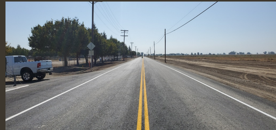
Road 16 Reconstruction