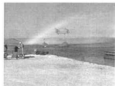
Operation Safe Harbor

With the assistance of Mackinac Island EMS, MMR personnel have renewed their CPR skills and obtained certification in the Stop The Bleed program every other year. In 2024, the team will work with EMS for TECC, Tactical Emergency Casualty Care designed to present a strong foundation of topics, concepts, principles, and skills specific to delivering emergency medical care for patients in a civilian tactical environment.