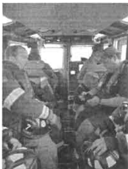
MIFD, MMR headed to Les Cheneaux Islands

MMR continued to be an asset to the community as we regularly returning EMS and police personnel to the island after they had escorted patients to the mainland on the last boat. Thanks to this assistance, EMTs and officers serve Mackinac Island for the remainder of the night. MMR has also assisted Cloverland Electric with transportation of personnel to the island.