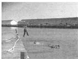
Dry Suit Training

MMR assisted the Mackinac County Emergency Management team with Operation Safe Harbor. This was a 2-day training with numerous other state and federal agencies assisting the September event.