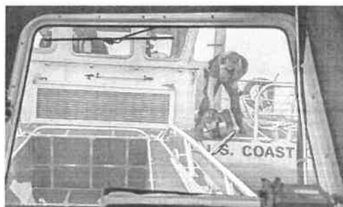
2 Boat Training with USCG Station St Ignace