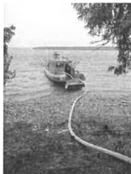
MMR pumping water for Clark Twp FD