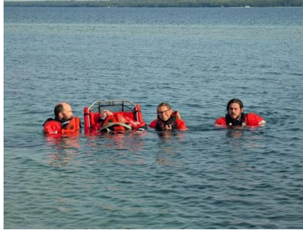
Dry Suit and Stokes Basket Training