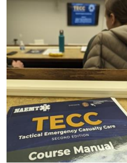
Tactical Emergency Casualty Care Training

With the assistance of Mackinac Island EMS, MMR personnel have renewed their CPR skills and obtained certification in the Stop The Bleed program every other year. In 2024, the team worked with EMS for TECC, Tactical Emergency Casualty Care designed to present a strong foundation of topics, concepts, principles, and skills specific to delivering emergency medical care for patients in a civilian tactical environment. This training was provided by a grant from Mackinac Island Community Foundation.