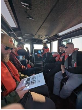
Training Future Coxswain

MMR had 23 training sessions with over 45 hours. MMR took advantage of every available opportunity to train and work with our new members including time with our partner, USCG Station St. Ignace. We train to the standards of our United States Coast Guard (USCG) counterparts, and this is a high bar to reach. Training can include docking, cross towing with USCG29, driver training, and search pattern drills among other duties.