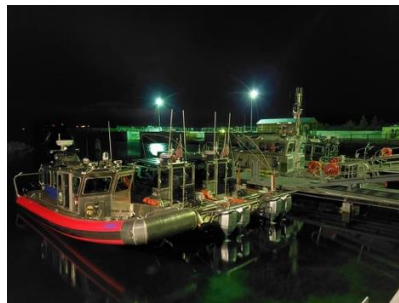
MMR before patrolling Mackinac Bridge's Labor Day Walk