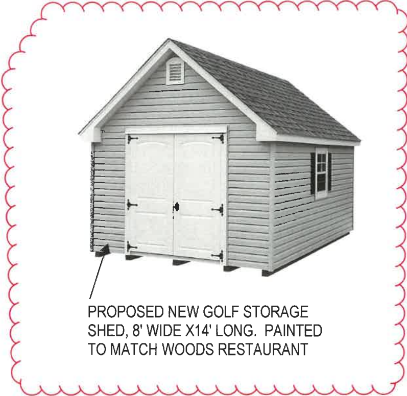
PROPOSED NEW GOLF STORAGE SHED, 8' WIDE X 14' LONG. PAINTED TO MATCH WOODS RESTAURANT

Revised Legal Description: refer to sheets 2A and 2B