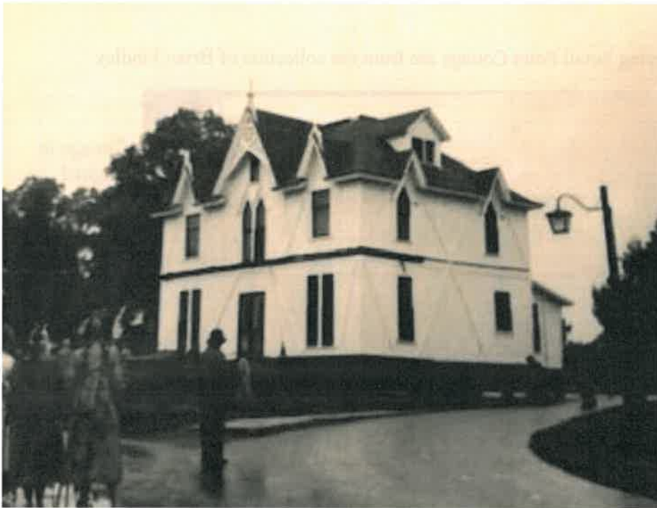
Cottage in process of move.