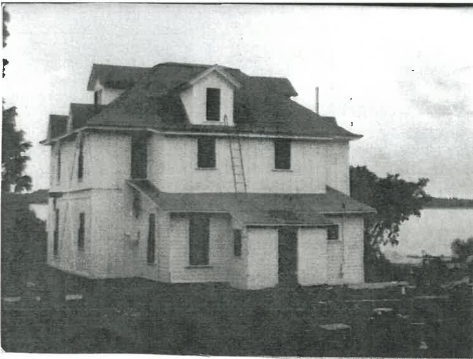
Rear elevation of cottage.