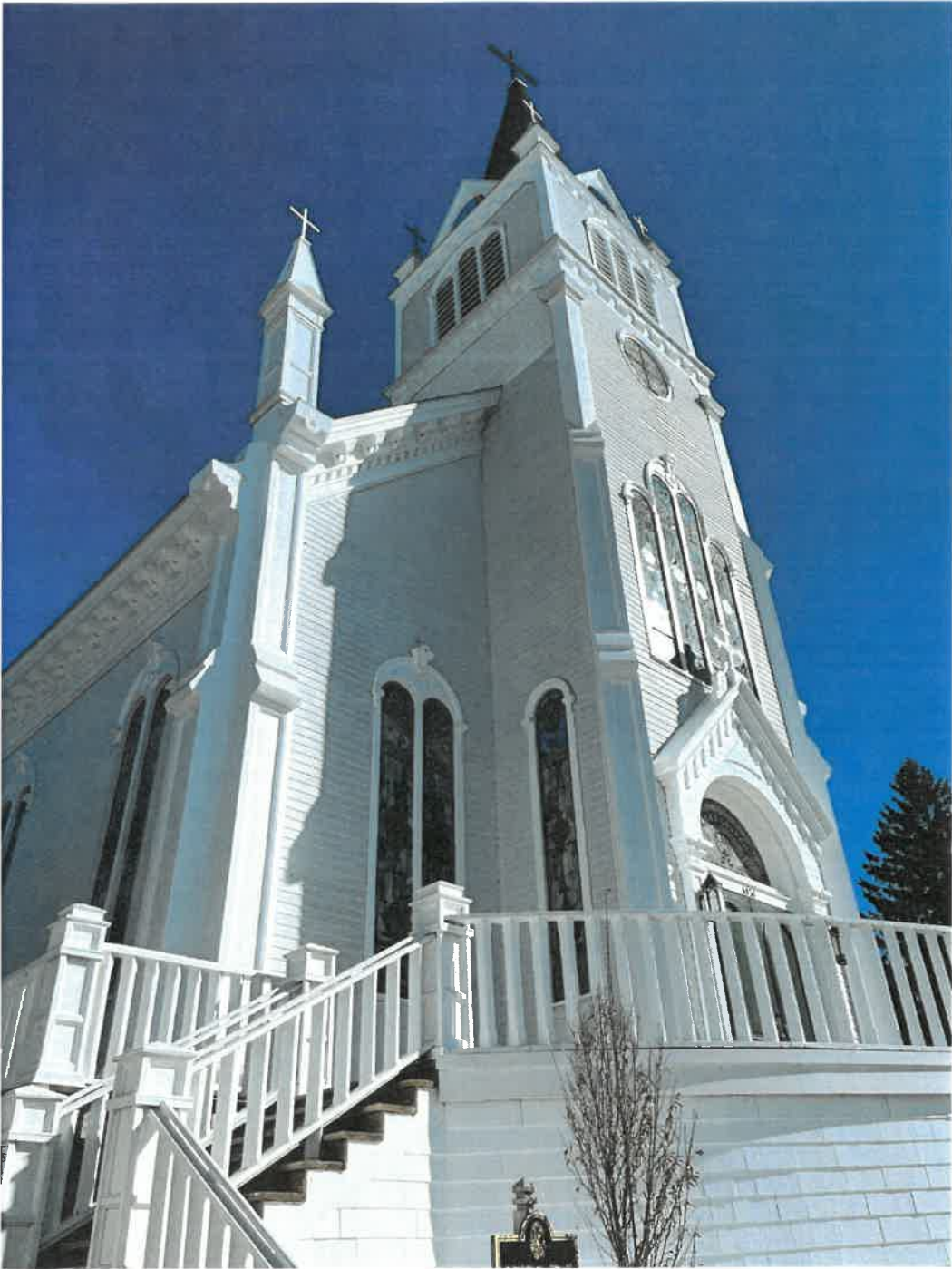
Photo 4. Saint Anne's Church, 6836 Main Street