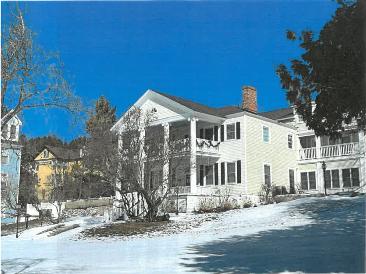
Photo 6. Harbour View Inn, formerly Madame Laframboise House, 6860 Main Street