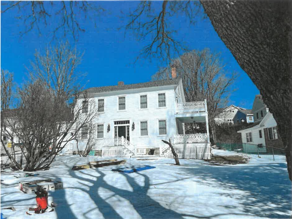
Photo 8. Jacob Wendell House, 6734 Main Street