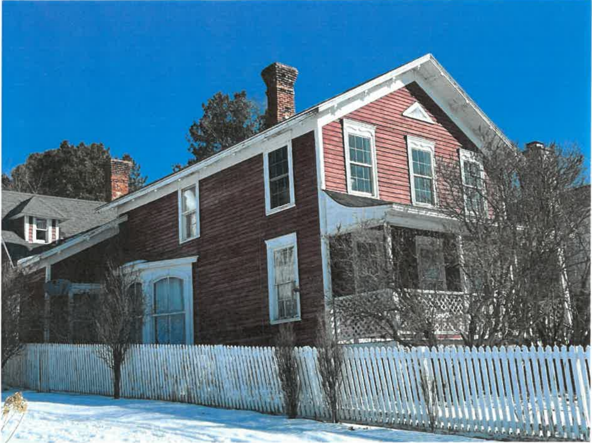
Photo 2. 6948 Main Street, c. 1850.