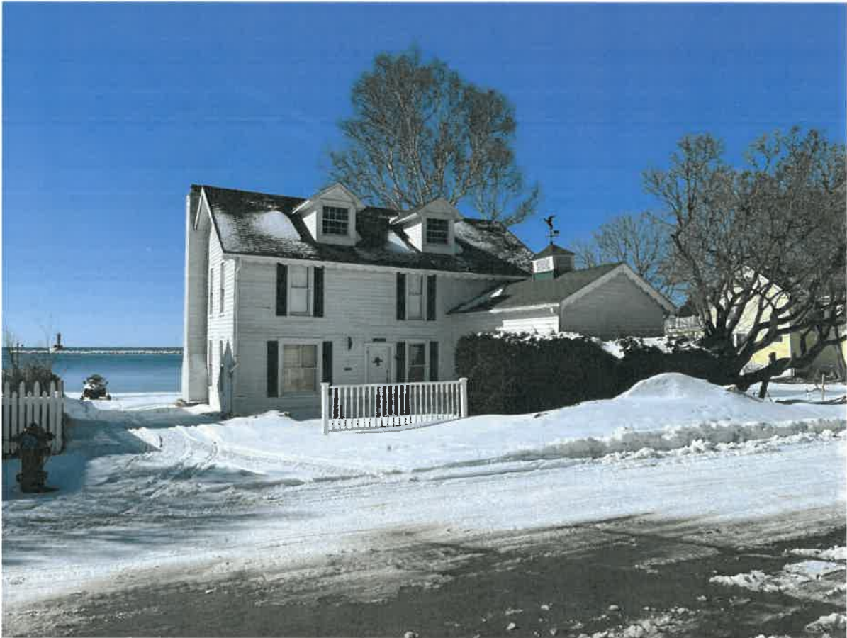
Photo 3. 6849 Main Street.