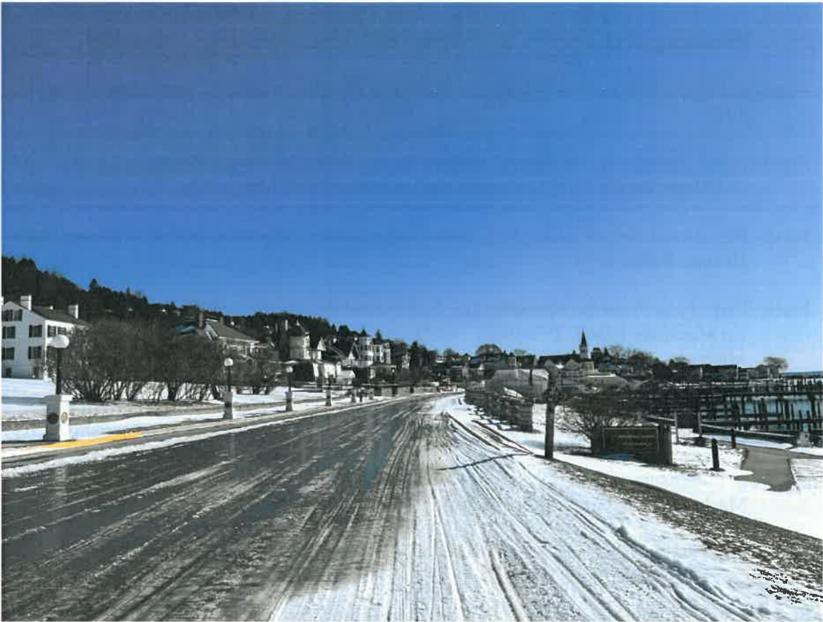
Photo 1. Looking East down Main toward the Mission District