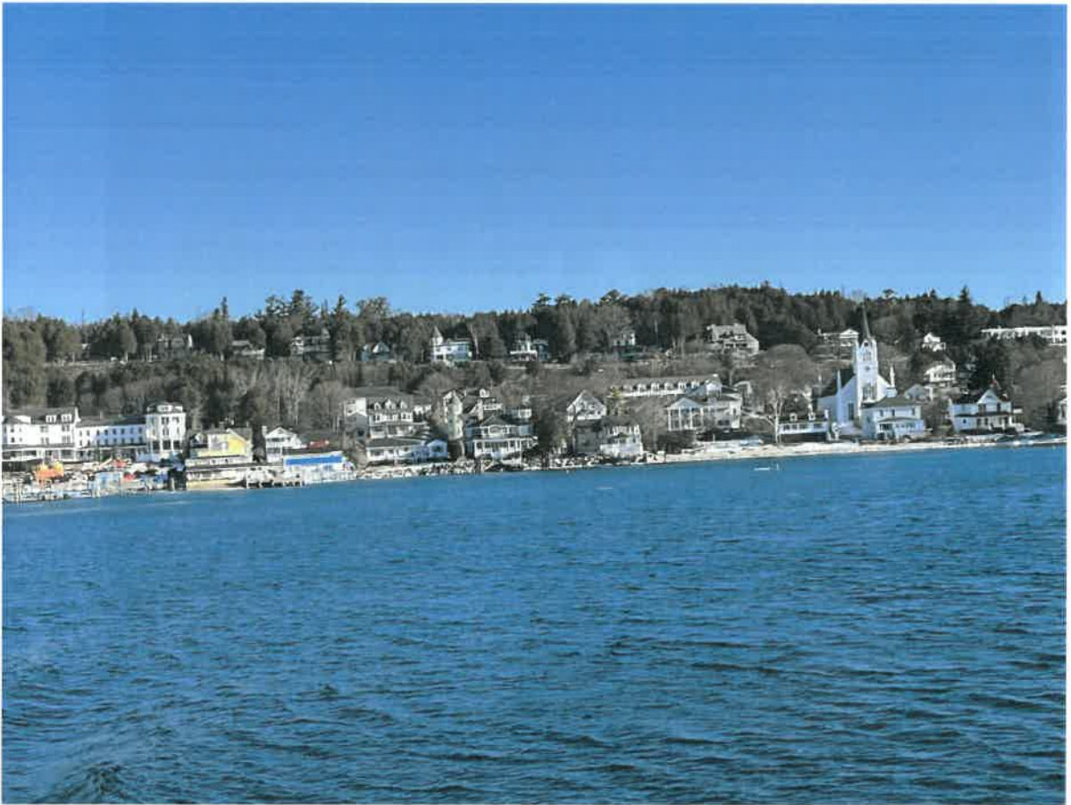
Photo 11 – The east end of Mackinac Island and Mission District from the bay.