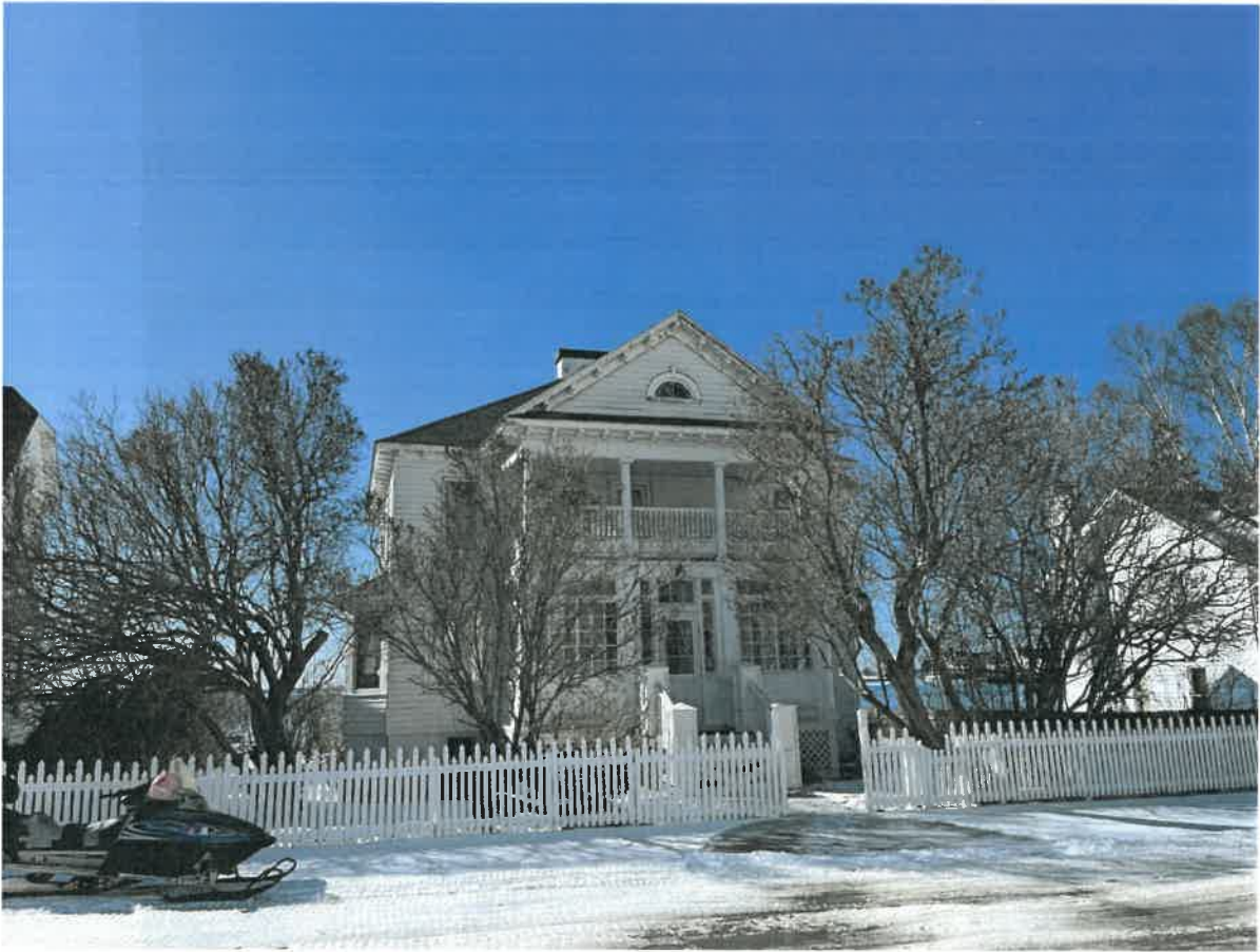
Photo 5. Saint Anne's Rectory, 6837 Main Street