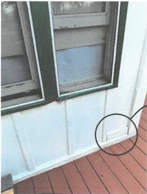
Patched rot holes in exterior wall