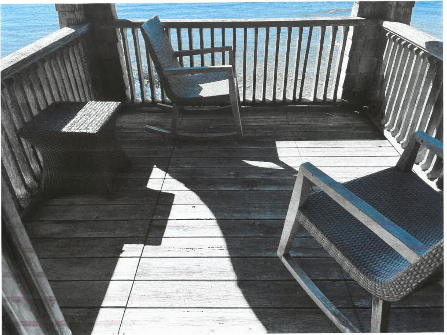
second story deck off West bedroom.