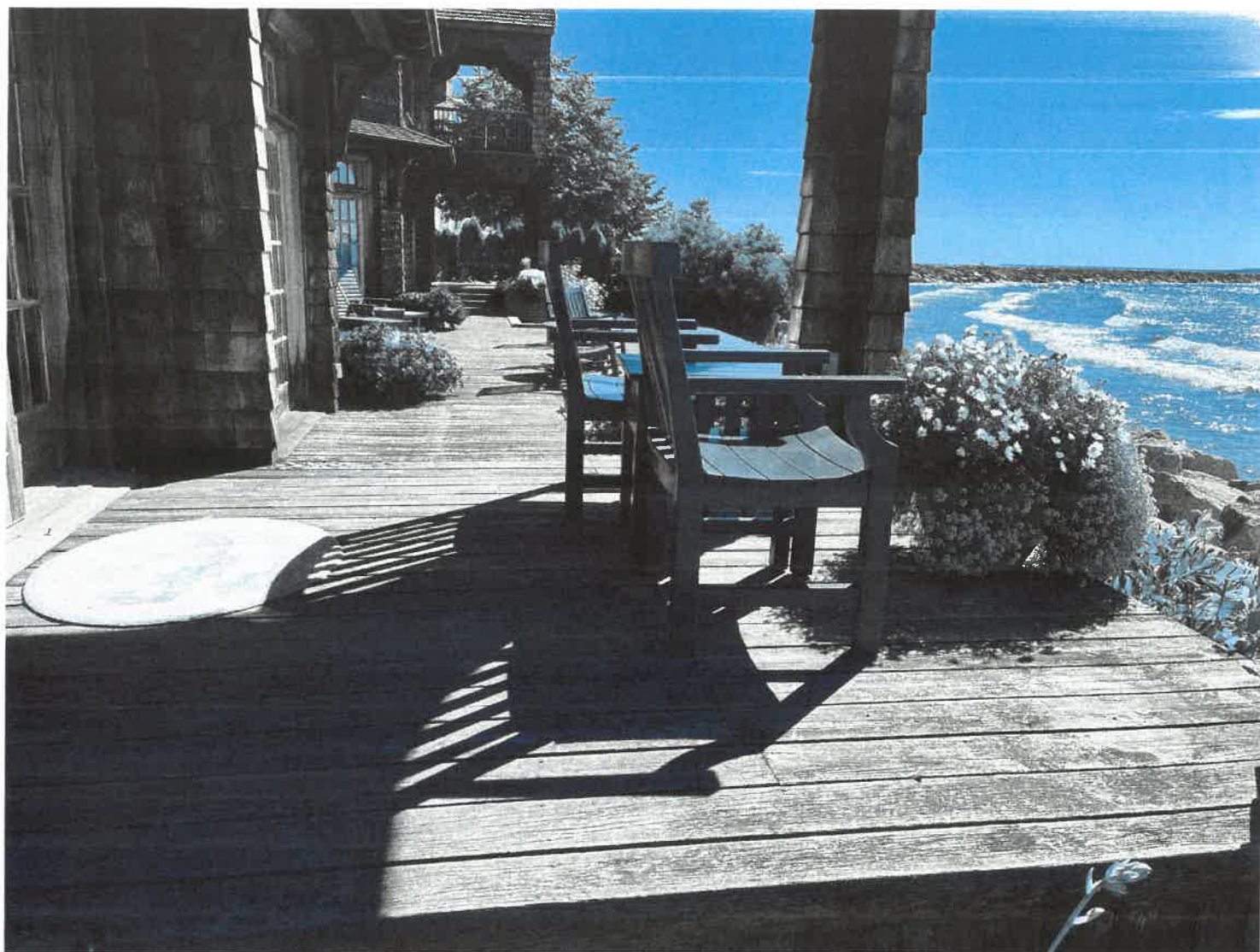
Back deck taken from the West