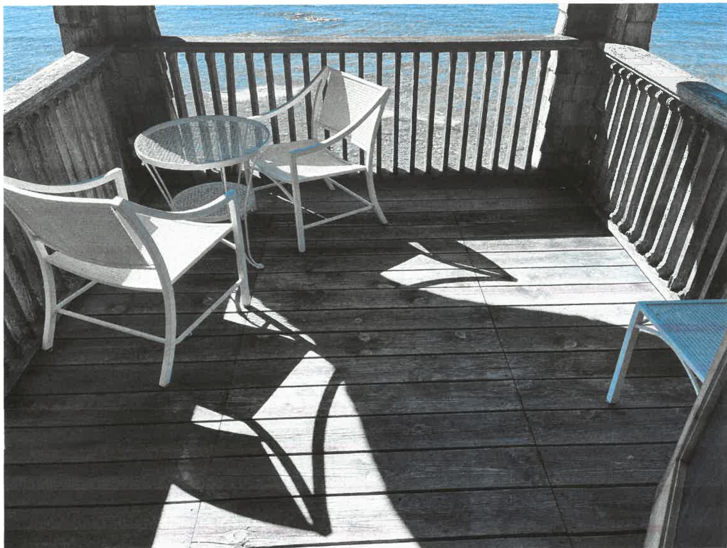
Second story deck off West bedroom.