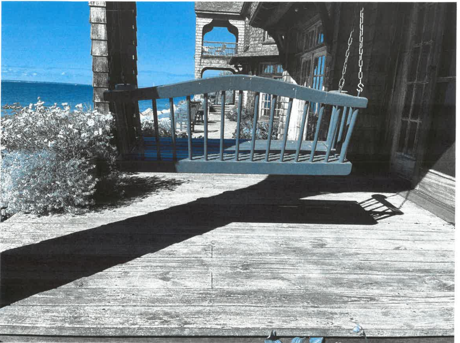
Back deck taken from the East