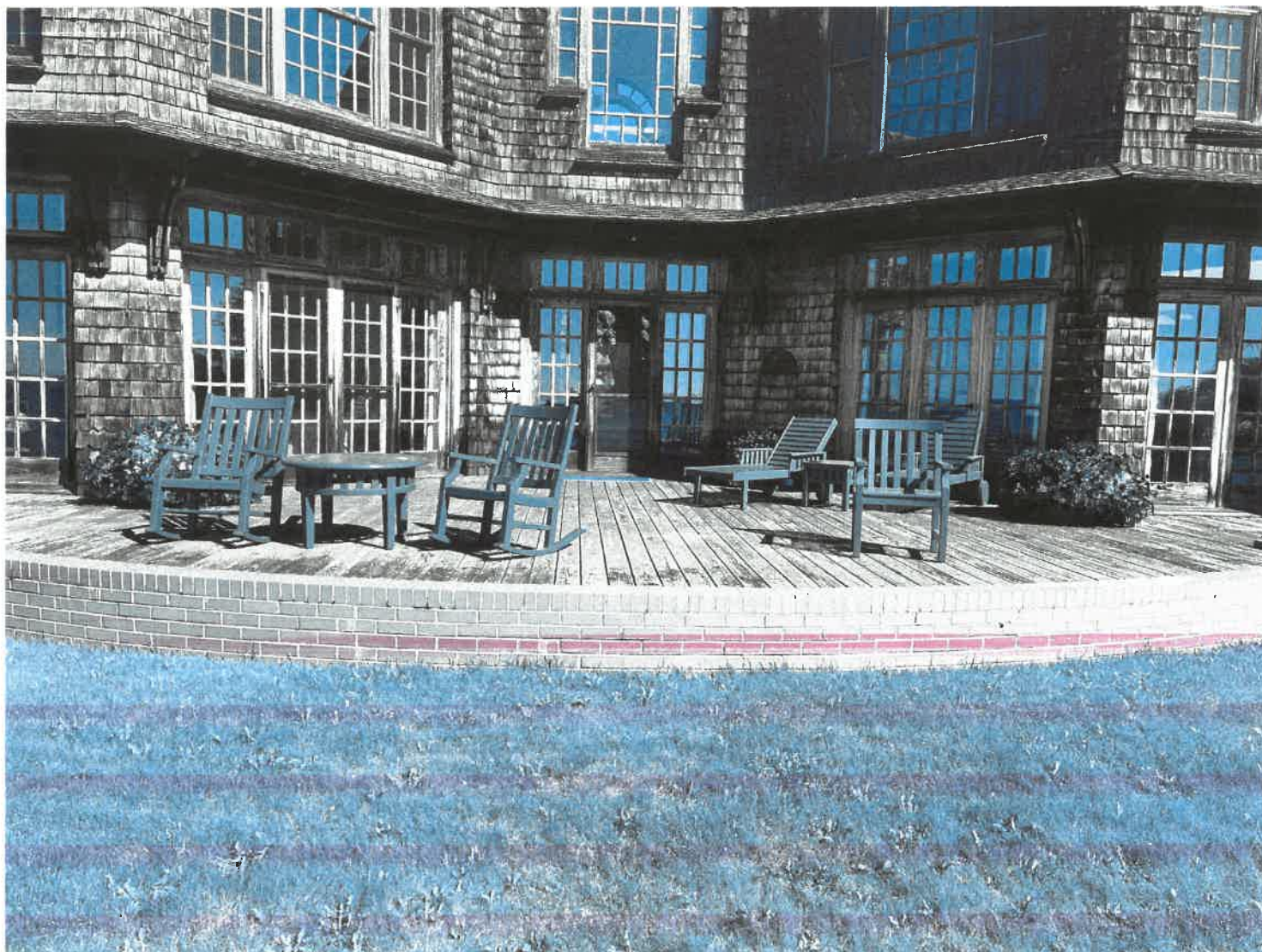
center of back deck taken from the South.