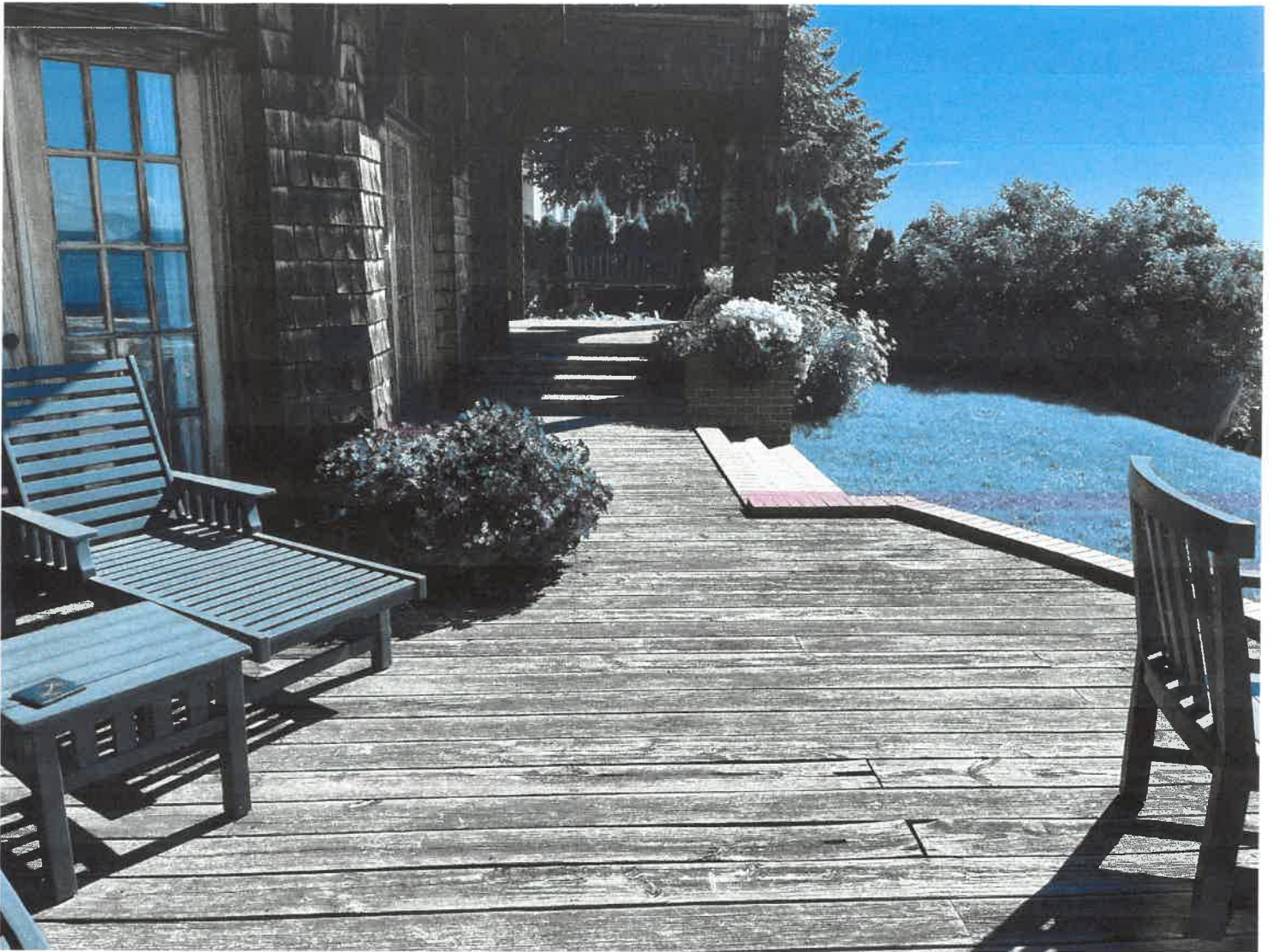
Back deck from center looking East