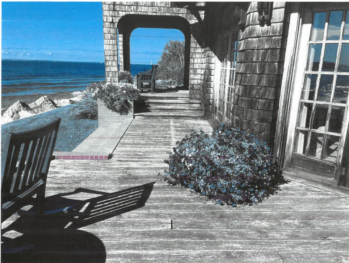
Back deck from center looking West.