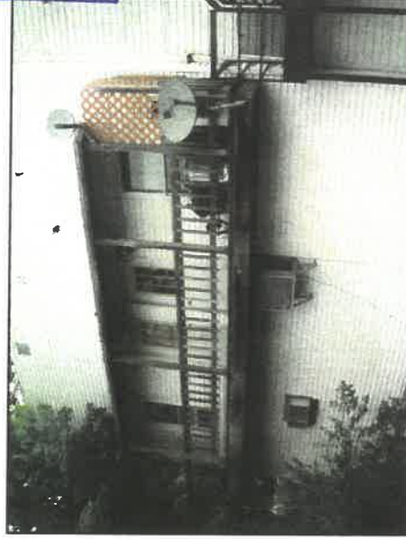
WEST WOOD FIRE ESCAPE TO BE REMOVED