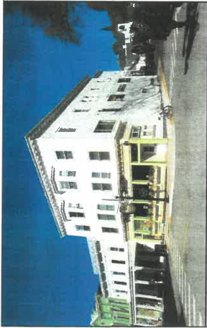
EXISTING MAIN STREET ELEVATION TO REMAIN UNCHANGED