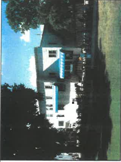
EXISTING FORT STREET ELEVATION TO BE ALTERED