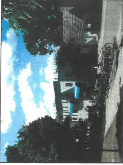
SIDE & REAR ELEVATIONS TO BE ALTERED