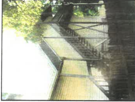
NORTH WOOD FIRE ESCAPE TO BE REMOVED