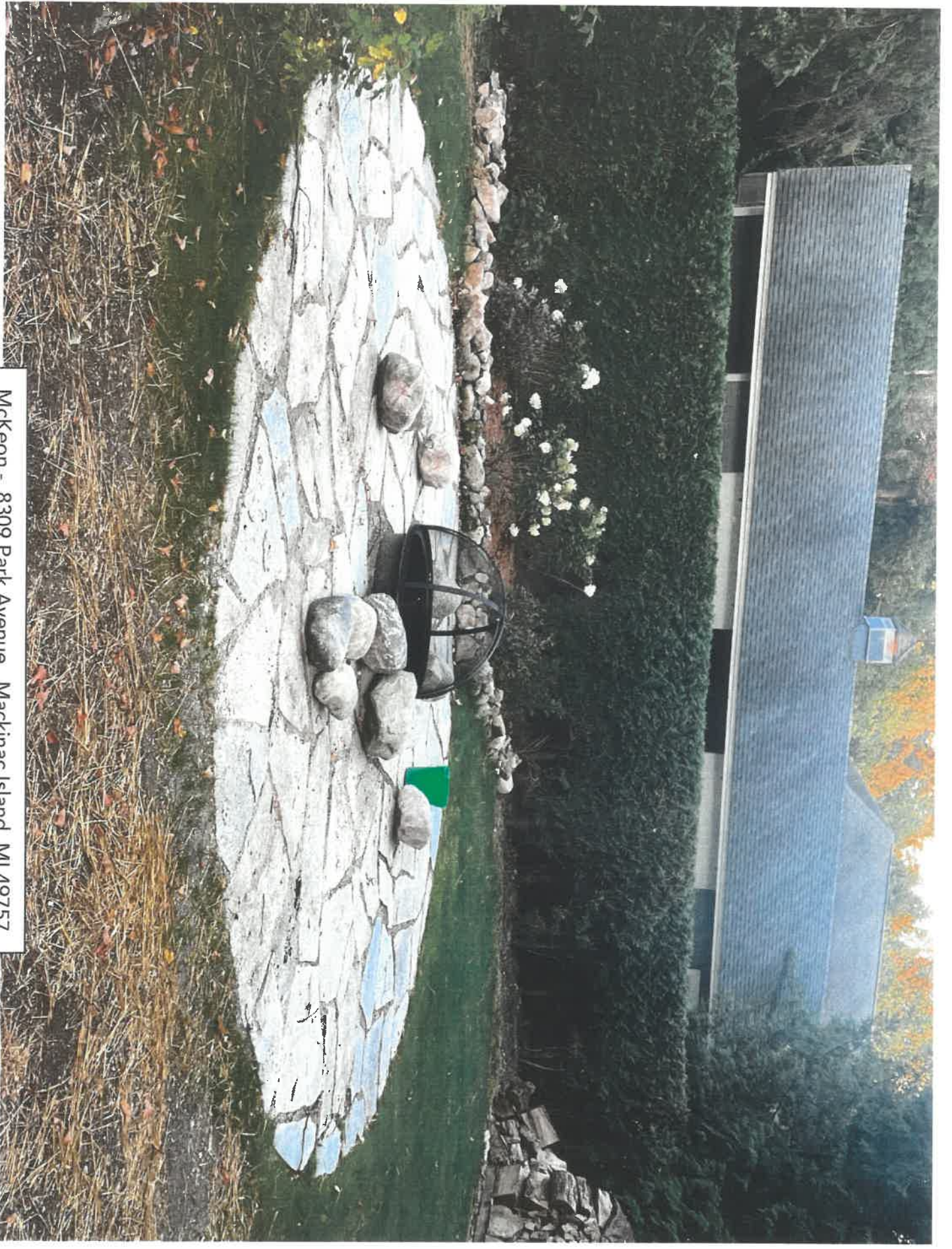
McKeon - 8309 Park Avenue Mackinac Island, MI 49757