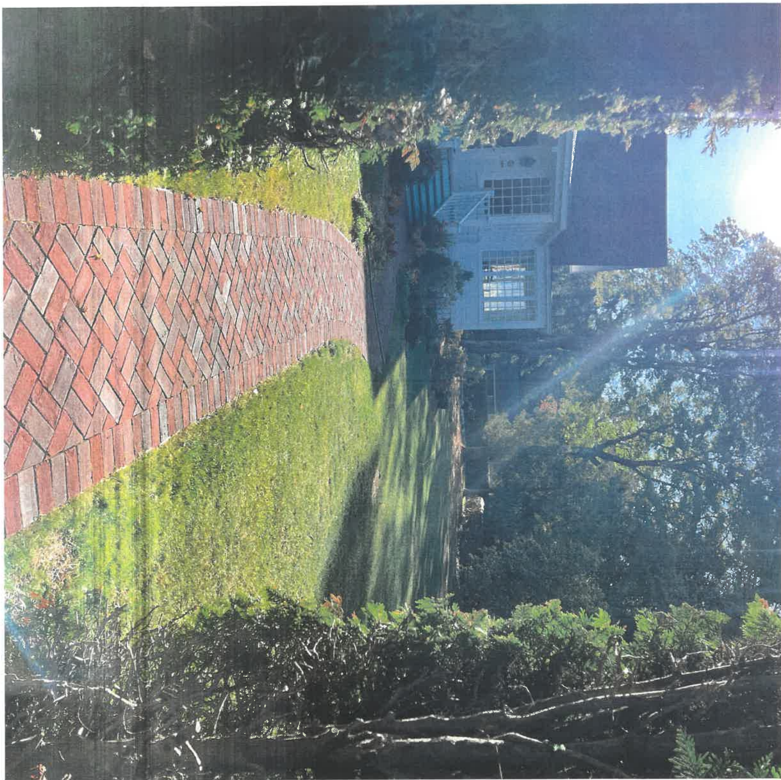
MCLEON - 8309 PARK AVE. MACKINAC ISLAND, MI. 49757