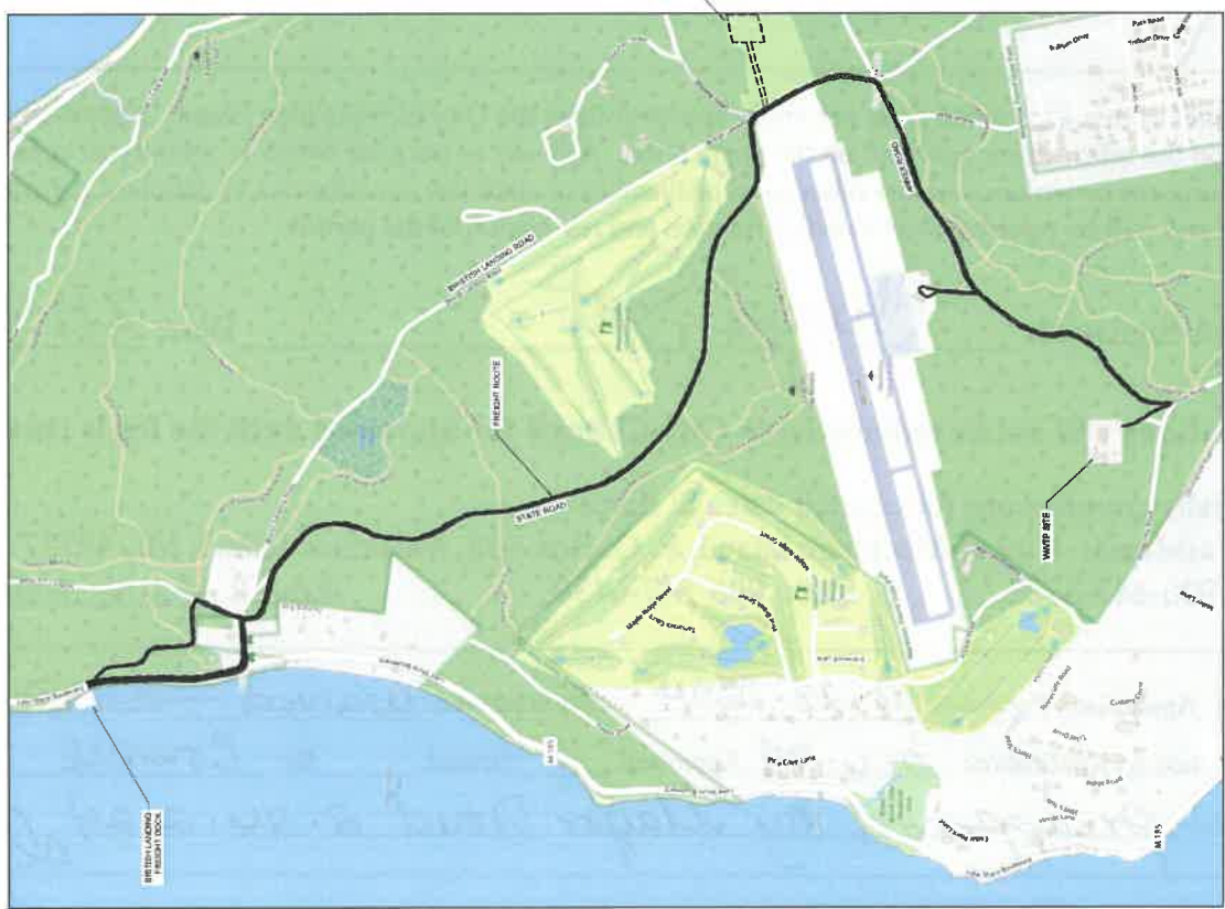
FREIGHT TRANSPORT ROUTE ON ISLAND PLAN