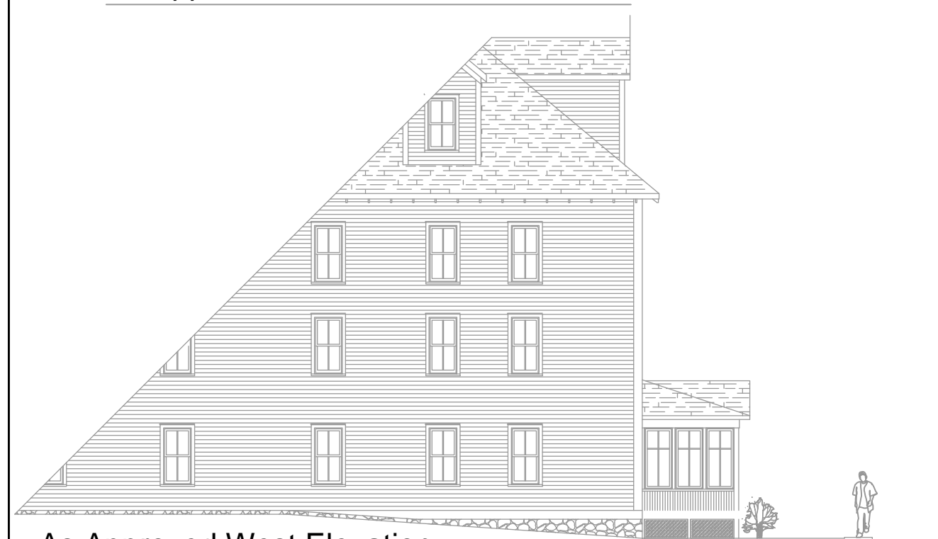
As Approved West Elevation