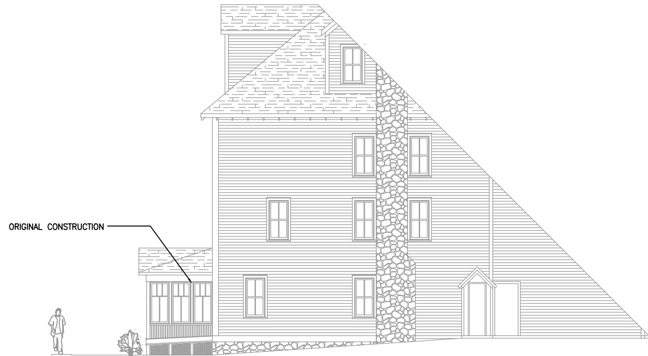
As Approved East Elevation