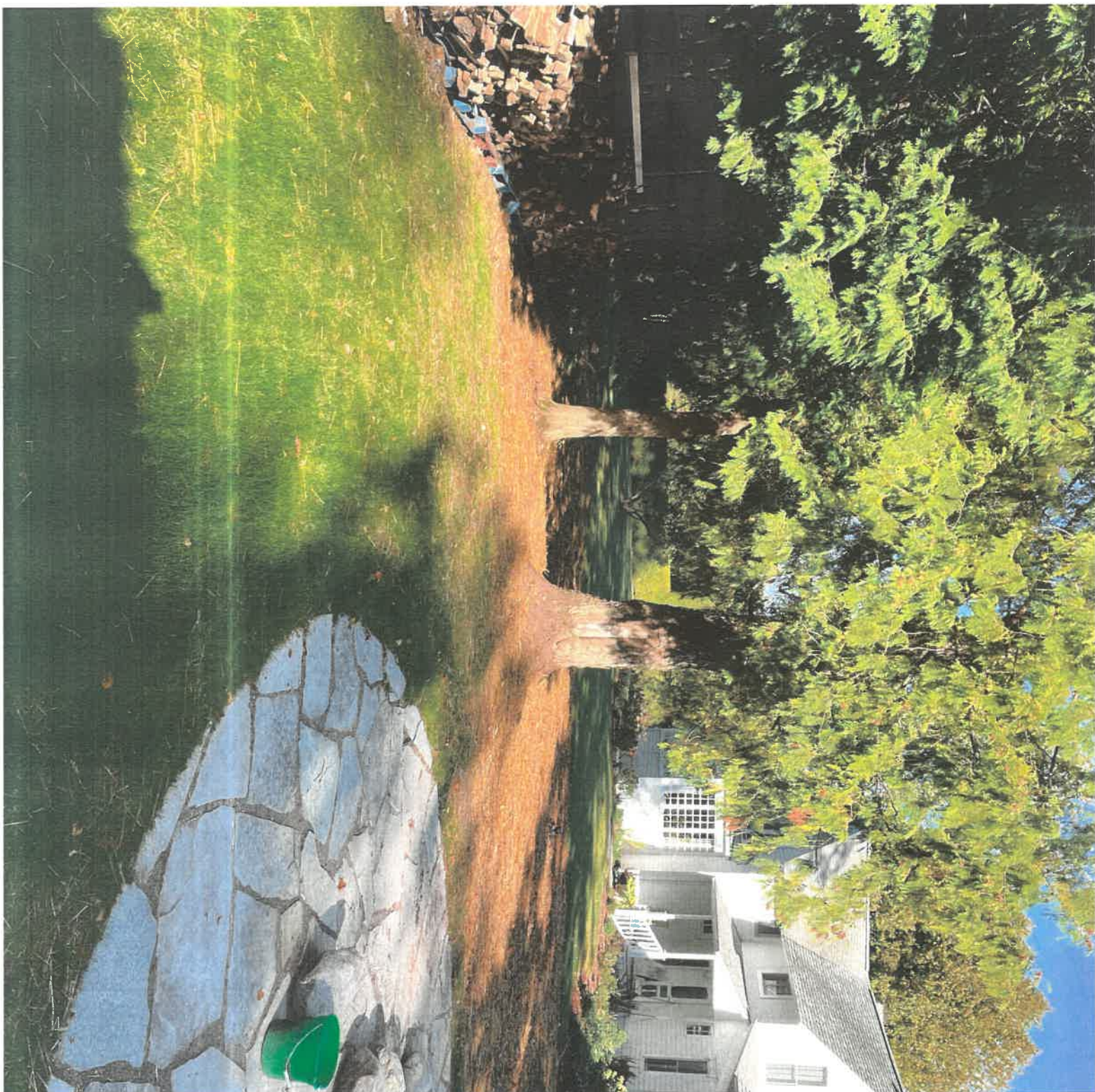
MCKEON - 8309 PARK AVE, , MACKINAC ISLAND, MI. 49757