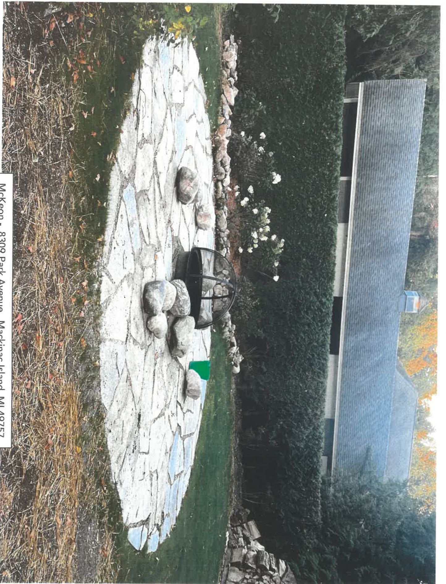
McKeon - 8309 Park Avenue Mackinac Island, MI 49757