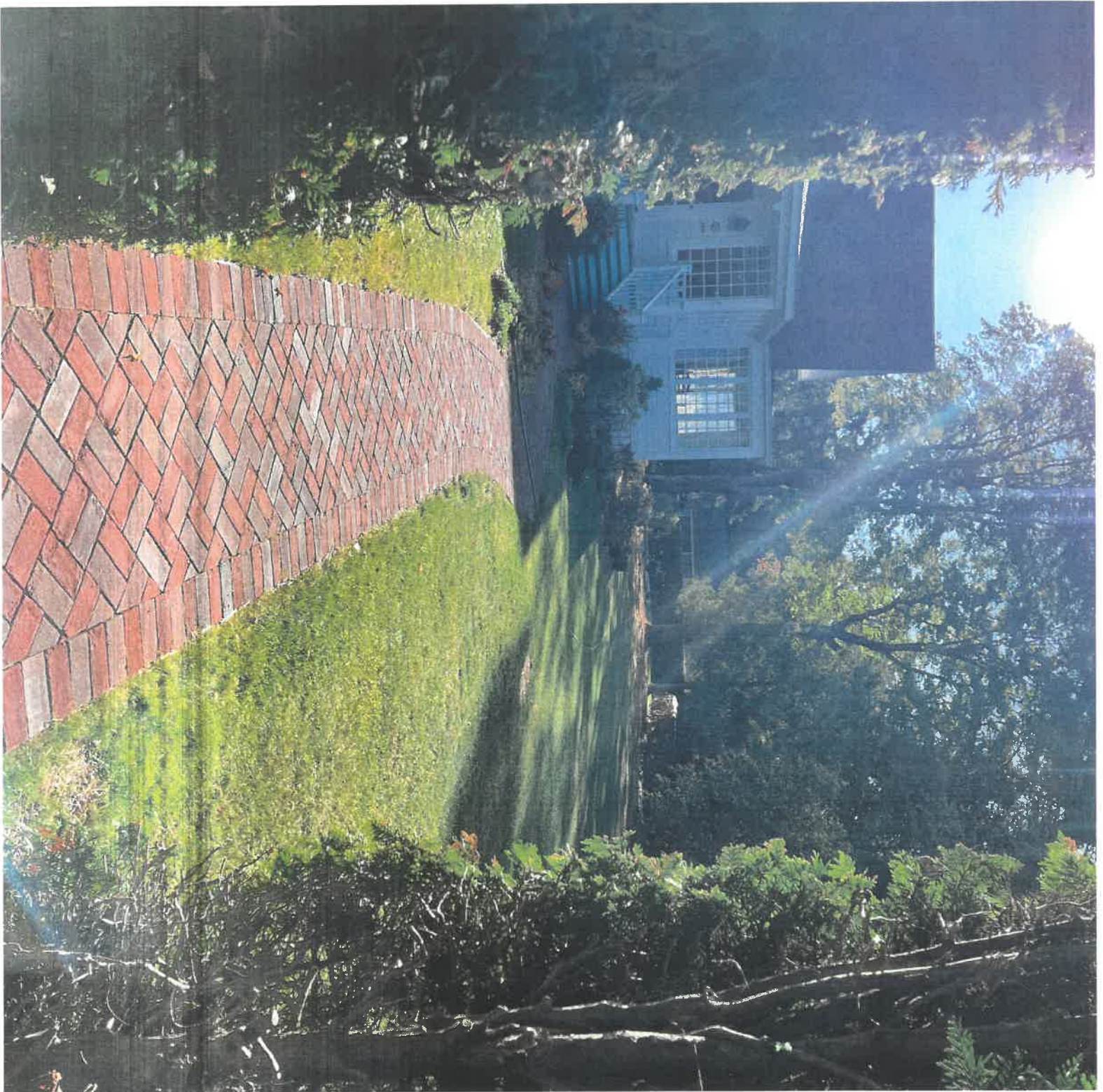
MCLEON - 8309 PARK AVE. MACKINAC ISLAND, MI. 49757