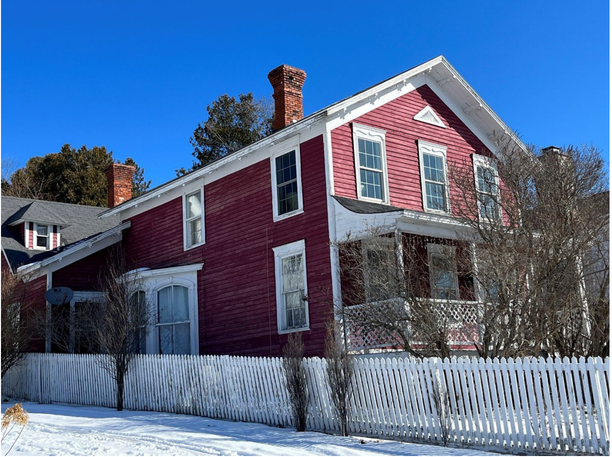
Photo 2. 6948 Main Street, c. 1850.