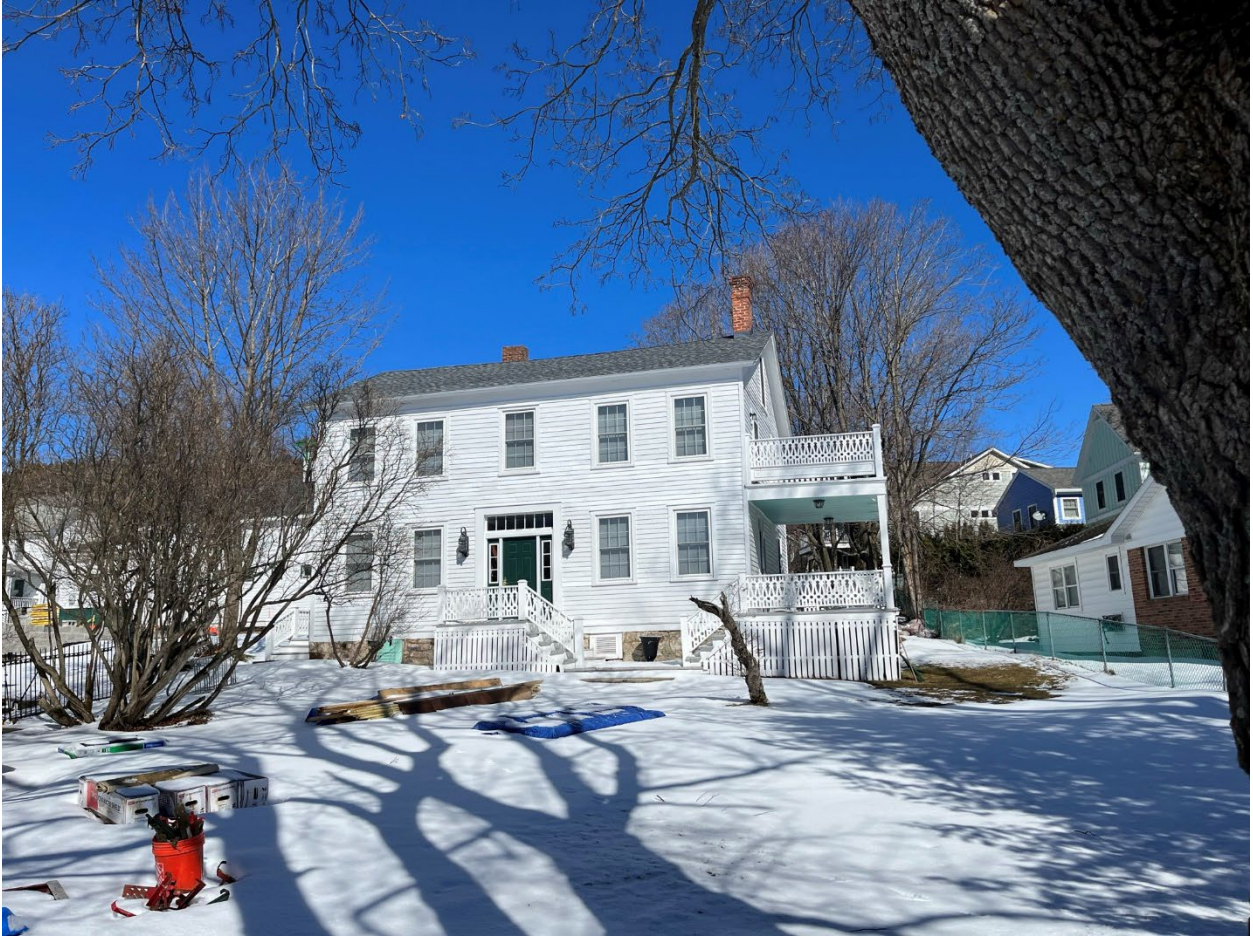
Photo 8. Jacob Wendell House, 6734 Main Street