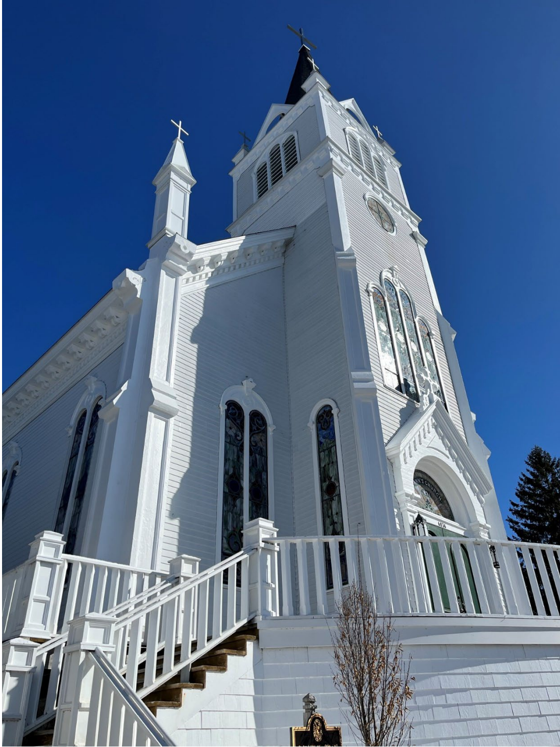
Photo 4. Saint Anne's Church, 6836 Main Street