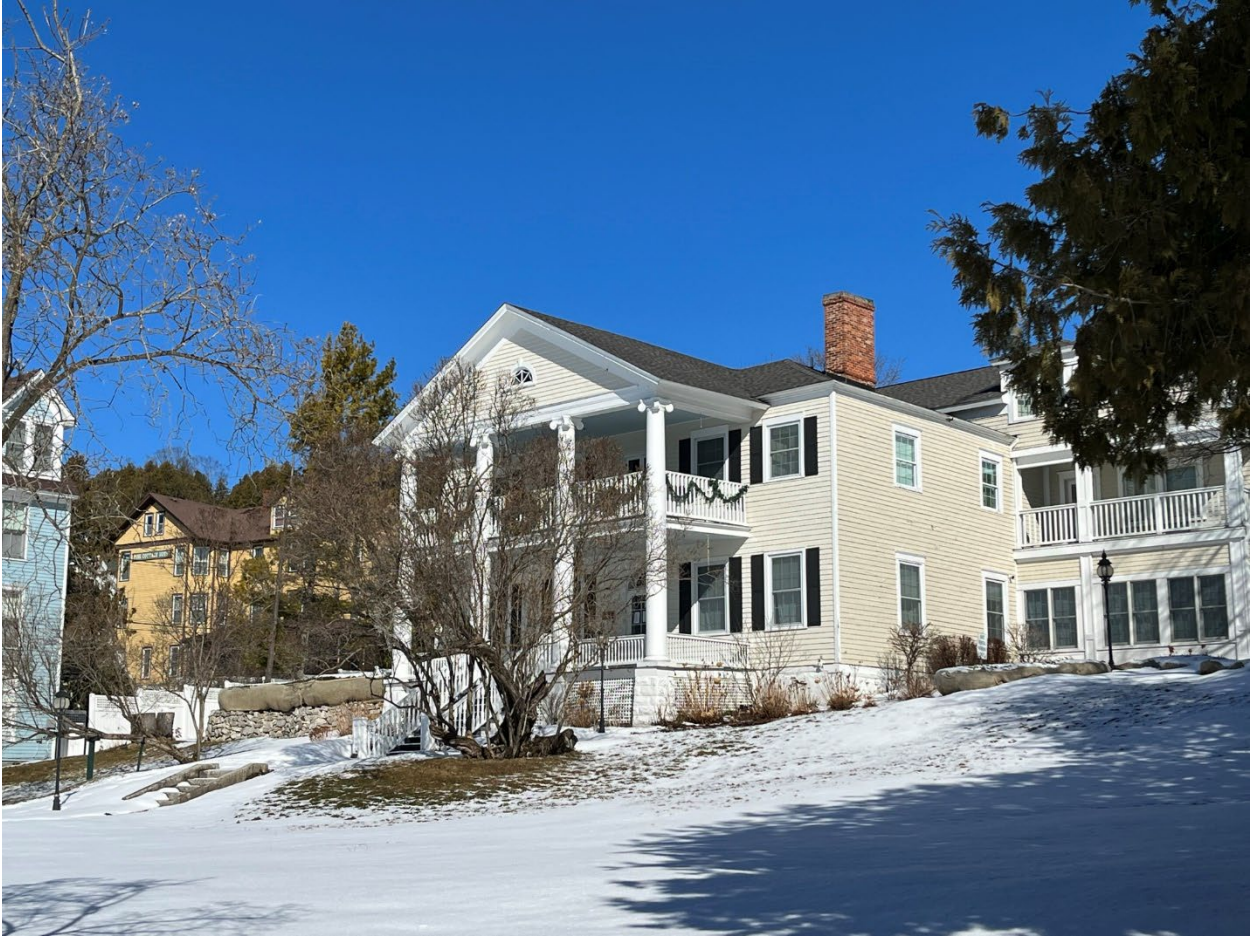
Photo 6. Harbour View Inn, formerly Madame Laframboise House, 6860 Main Street