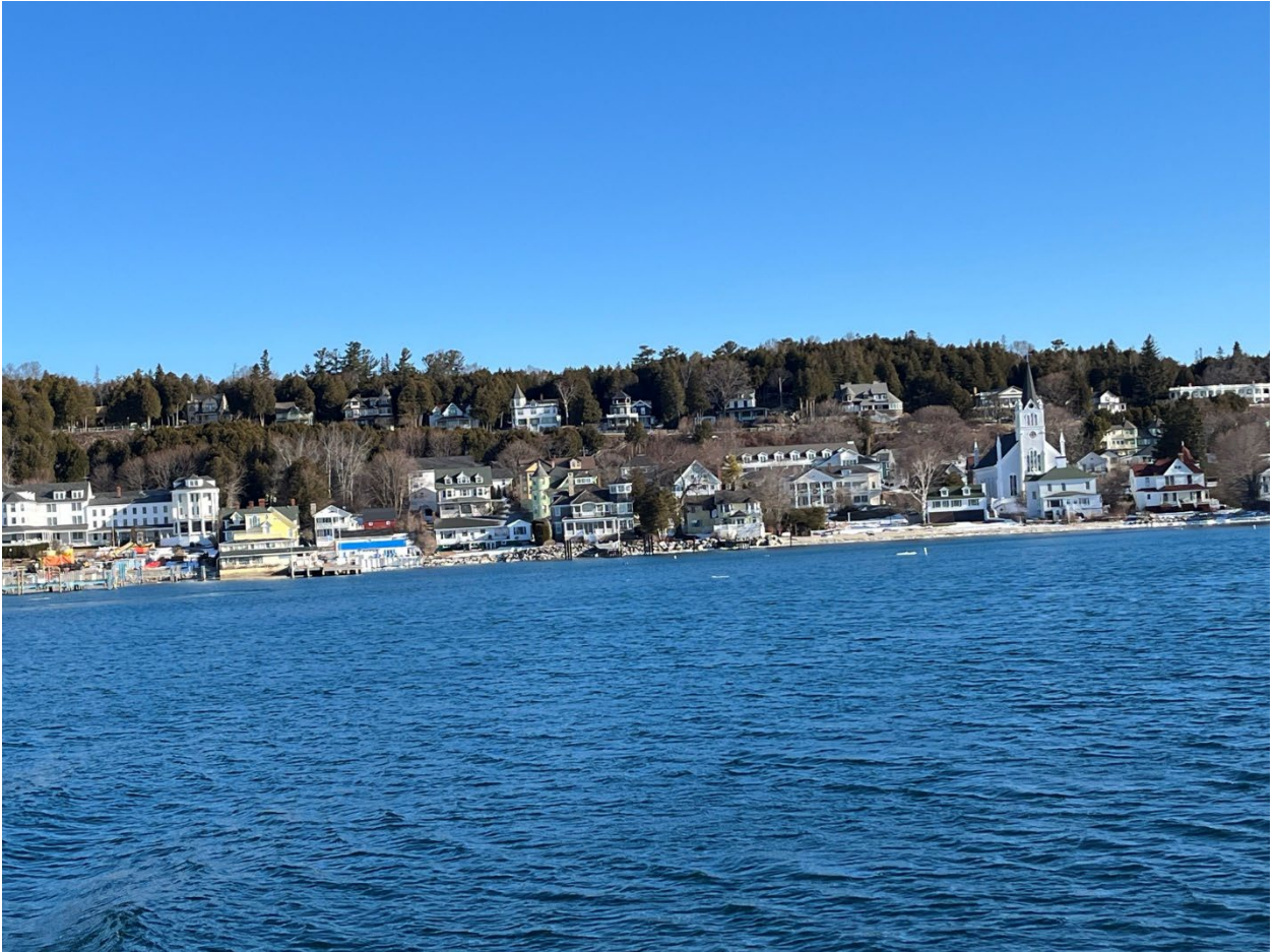
Photo 11 – The east end of Mackinac Island and Mission District from the bay.