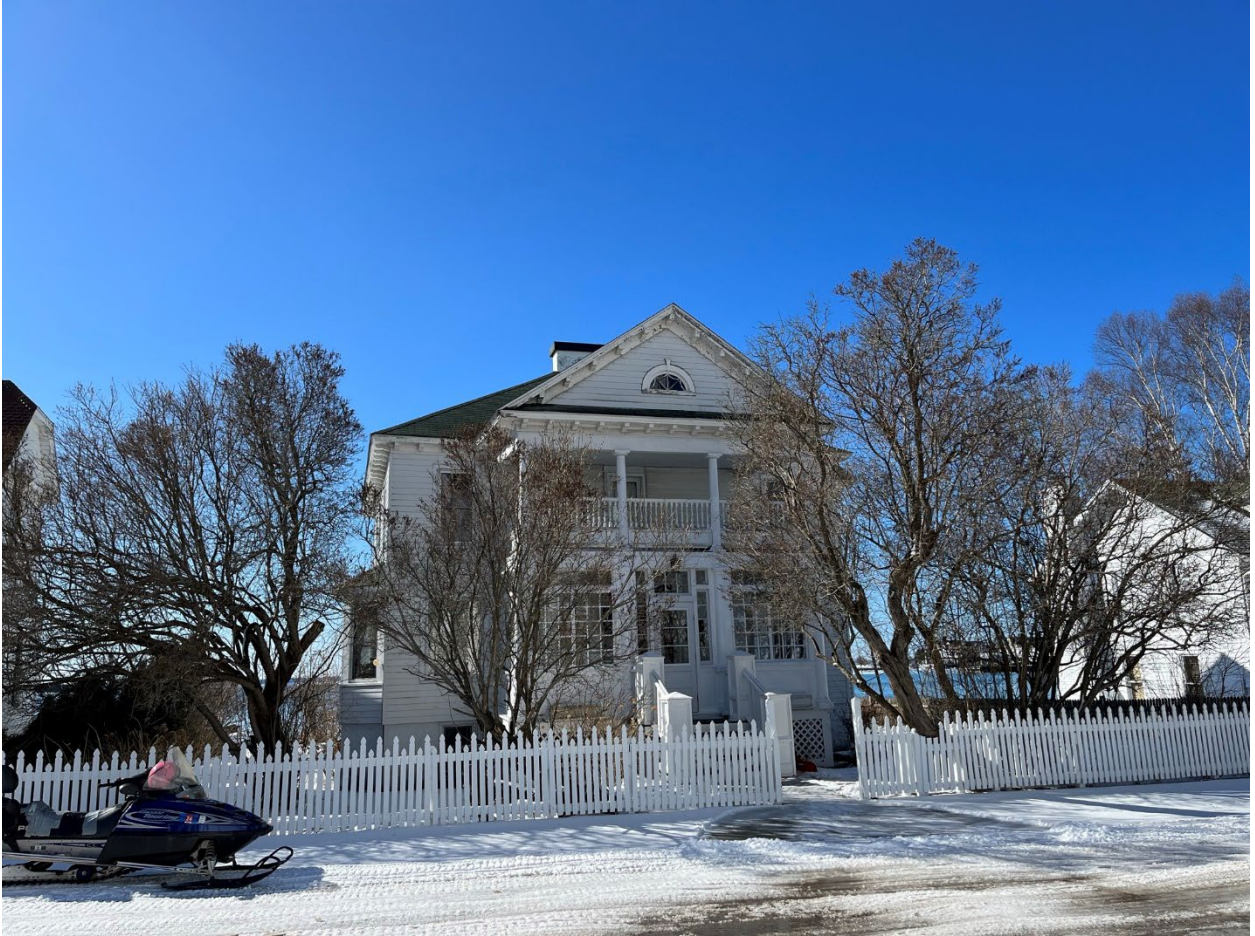
Photo 5. Saint Anne's Rectory, 6837 Main Street