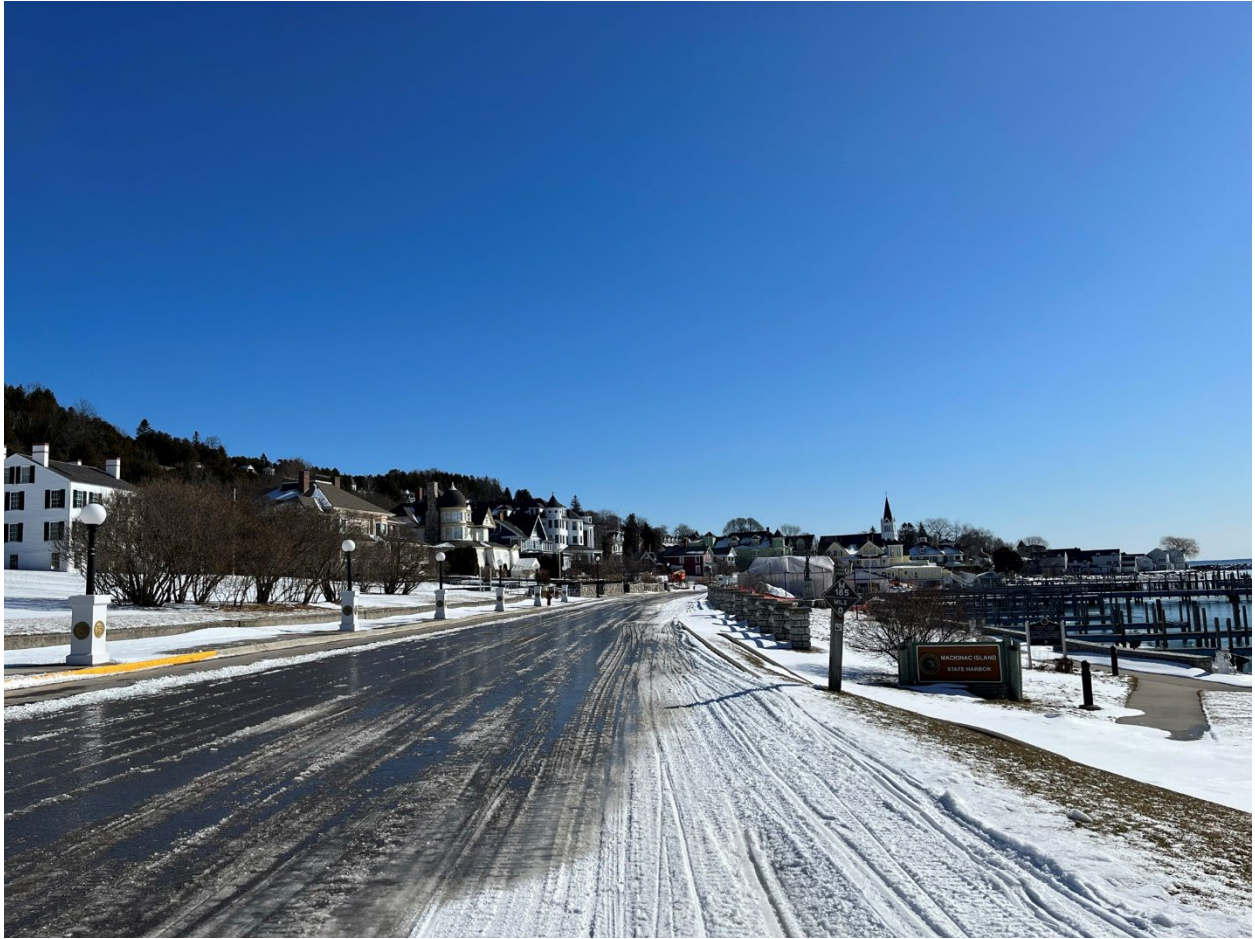
Photo 1. Looking East down Main toward the Mission District

PHOTOGRAPHS March 2023