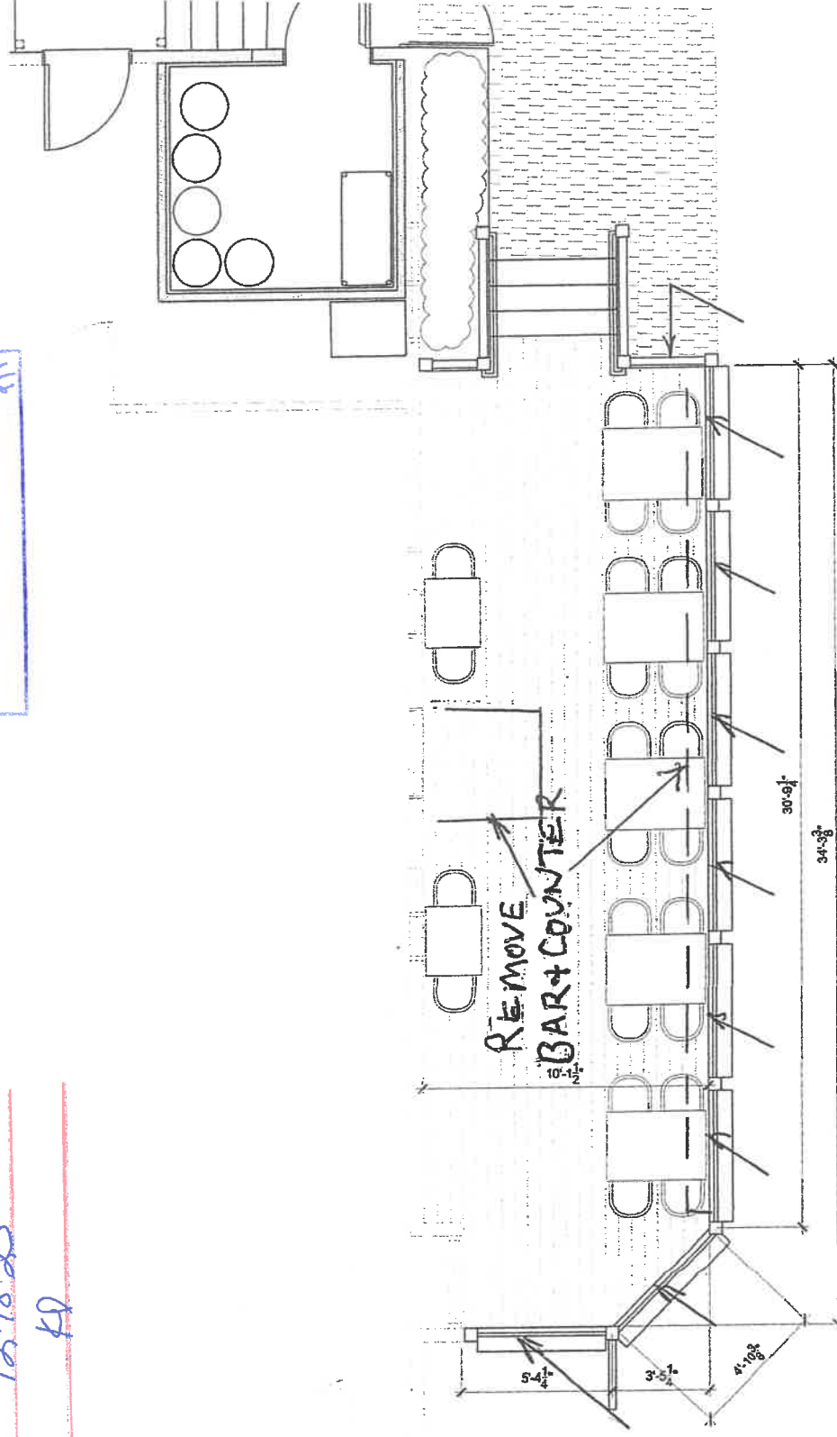
FIRST FLOOR PLAN SCALE 1/4" = 1'-0"