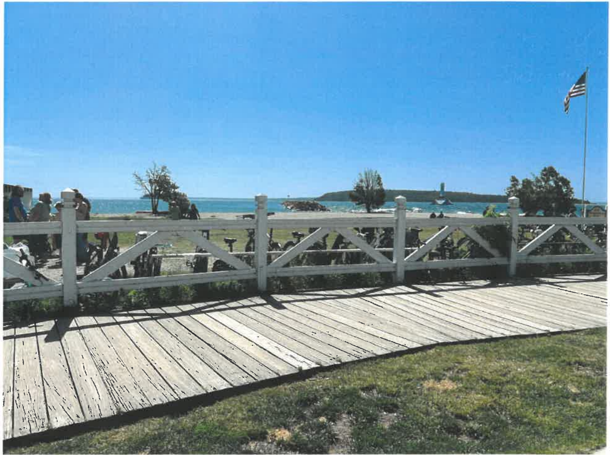
Mesh banner at Windermere