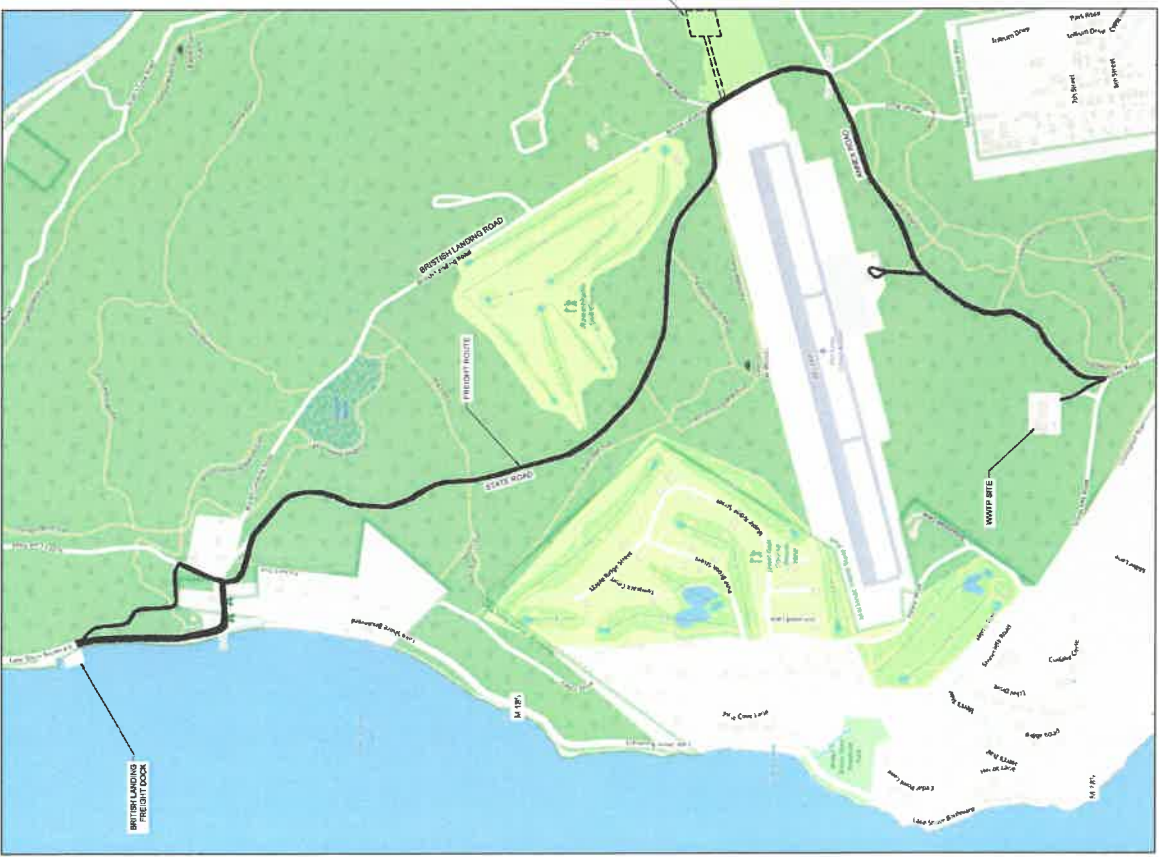
FREIGHT TRANSPORT ROUTE ON ISLAND PLAN

MACKINAC ISLAND AIRPORT (852) MACKINAC COUNTY AIRPORT (852) MACKINAC ISLAND AIRPORT (852) ISLAND ACCESS PLAN