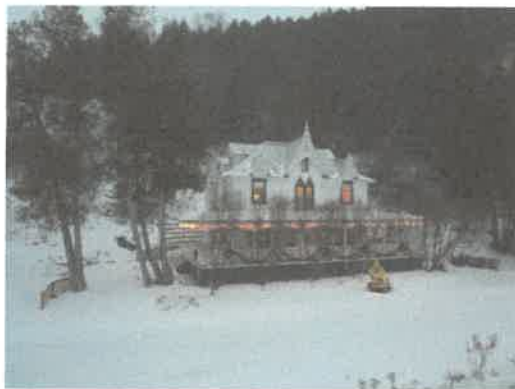
Ariel view of structure

The front porch of the house requires a new roof. The project will be the removal of a single layer of black asphalt shingles and replacing it with new black asphalt shingles. Total number of squares is estimated at 15 squares. The white gutters will also be replaced. The work will be completed by Matt Myers of Mackinac Island.