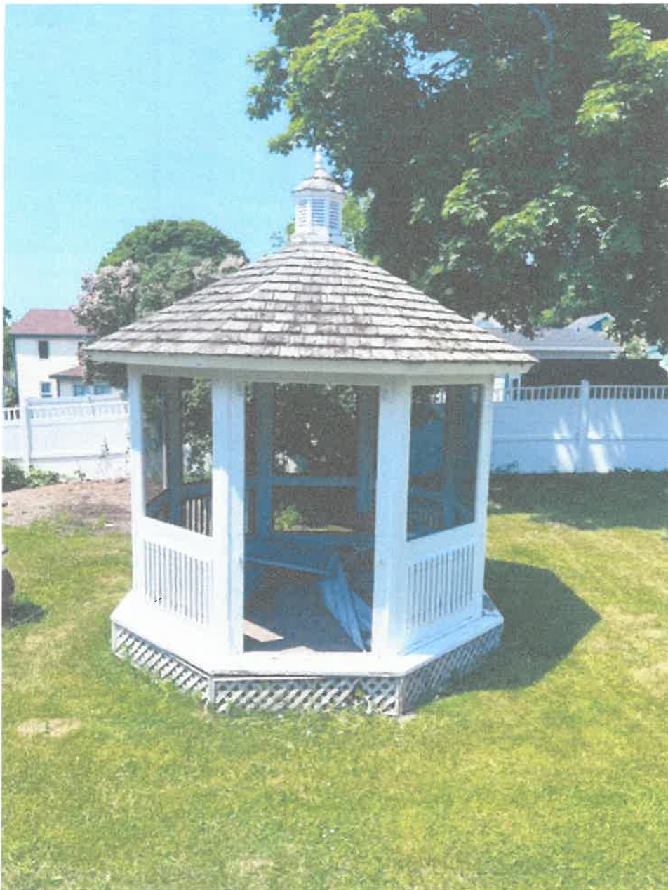
Vixen Hill Gazebo

Gazebo* to be installed at 6823 Huron Street (Main Street)